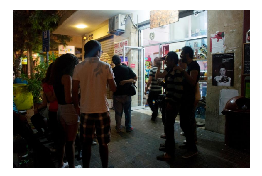
Figure 6.4: Young Syrian (on the left) having a drink in Mar Mikhael with a group of Lebanese students.

young Syrians having drinks with a group of Lebanese, shouting and laughing. It appears that cheap alcohol and weak social control offer young migrants a window, even temporary, where they can afford, and sometimes be offered, a drink or two.