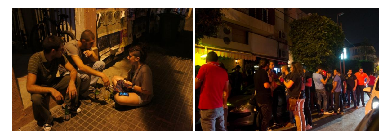
Fig. 3: Drinking outside in Mar Mikhael, Armenian Street.