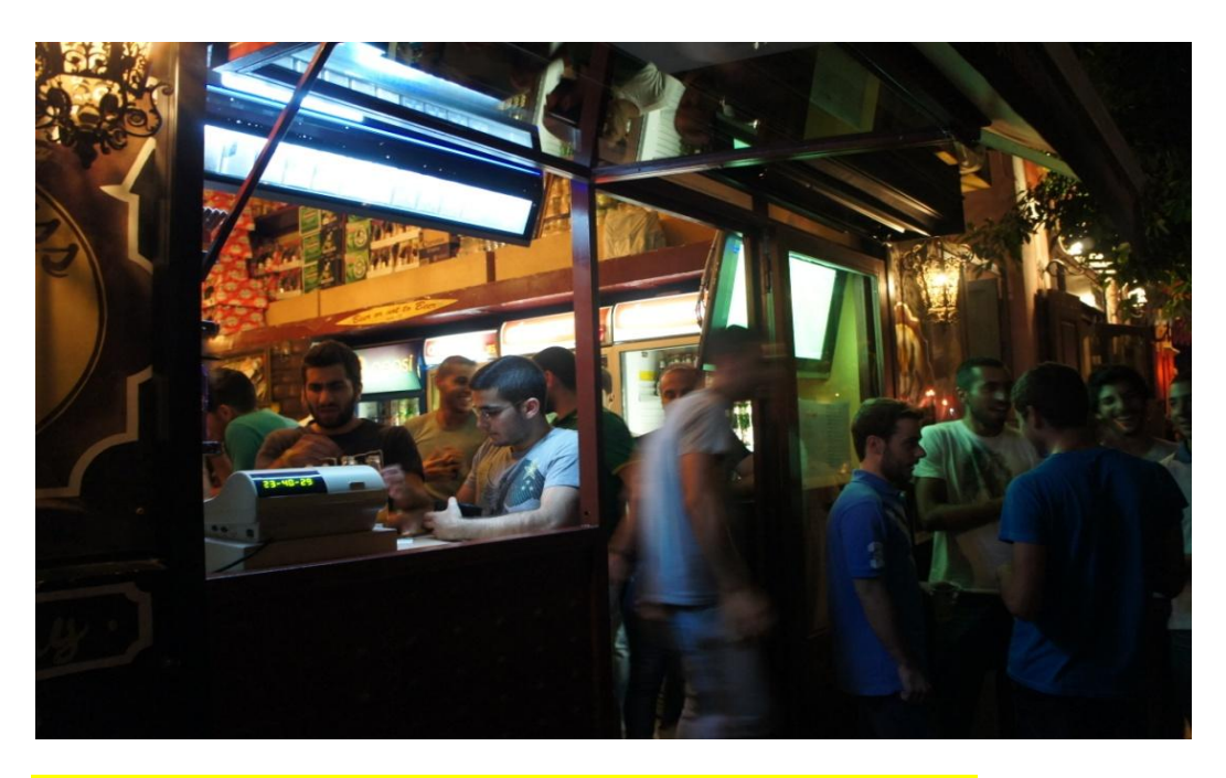
Fig. 6.2: Crew Express, Armenian Street. Picture by M.Bonte, June 2013

The openness of such venues is characterized by the absence of doors or wide windows like at Internazionale . It is then quite easy to come and go from the street to the bar, and to walk from bar to bar. Paradoxically, it is also possible to stand at the same place for a whole night and see a very diverse range of people. The Calle pub – at the juncture between Gemmayzeh and Mar Mikhael – takes this principle of an open public drinking space even further. Indeed, the name of the venue, the Spanish translation of 'street', literally signals the spatial configuration as prioritising an openness which crosses over between the venue and the street outside. The street lights, the tags and graffiti on the walls, the paved floor are elements meant to recreate an external atmosphere inside. Many people surveyed in the street said they appreciate Mar Mikhael for this spatial configuration that allows being outside, drinking, and meeting new people, with one commenting that 'I like it, this is casual', while another explained that 'this is a more friendly atmosphere than in classy pubs, and alcohol is cheap'. Drinking has indeed become the main purpose for the revellers, and the main nocturnal activity of the area. This feature is claimed by both bartenders and revellers. The owner of one bar described how: