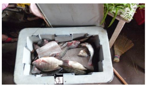
Figure 2: The cool boxes

In the fish circuit, the volumes sent by the fishermen are done so on a just-intime basis: there is no stock. Fish are caught in the morning and sold the same day or, at the latest, the next morning because of the lack of any reliable means of conservation. The fish are transported by car, motorcycle or boat and are placed in cool boxes to prevent them from going off, although this is not always possible. The quantity of cool boxes that can be transported is limited either by vehicle capacity or by the driver's decision to take passengers and freight. Cool boxes are well worn and not completely sealed, thus affecting the freshness of the fish. Hence, aside from a transport limited to small quantities, disruptions are considered normal, as is the lack of reliability of devices and products. People are used to living with many objects that are out of order.