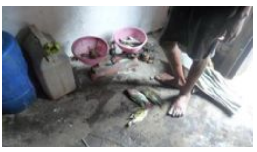
Figure 1: A fish gatherer weighing fish products provided by a fisherman

The fishermen specialize in sea fishing or freshwater fishing but the type of fish or shrimp they bring up in their baskets or nets often varies<sup>2</sup>. In the villages, the production of goods fluctuates in relation to climatic events but also depending on time spent farming and fulfilling self-consumption needs (rice and manioc but also market gardening, home breeding and the manufacture of charcoal). Production for exportation is the primary means to acquire cash: it is generally intermittent, organized on a short-term basis and based on limited or specific monetary needs: meeting everyday spending needs, covering schooling expenses3 and participating in a family event, etc.