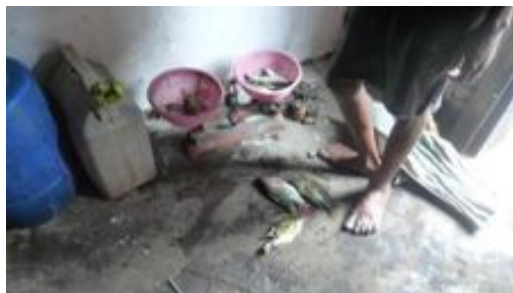
Figure 1: A fish gatherer weighing fish products provided by a fisherman

The fishermen specialize in sea fishing or freshwater fishing but the type of fish or shrimp they bring up in their baskets or nets often varies 2 . In the villages, the production of goods fluctuates in relation to climatic events but also depending on time spent farming and fulfilling self-consumption needs (rice and manioc but also market gardening, home breeding and the manufacture of charcoal). Production for exportation is the primary means to acquire cash: it is generally intermittent, organized on a short-term basis and based on limited or specific monetary needs: meeting everyday spending needs, covering schooling expenses 3 and participating in a family event, etc.