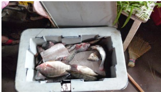
Figure 2: The cool boxes

In the fish circuit, the volumes sent by the fishermen are done so on a just-in-time basis: there is no stock. Fish are caught in the morning and sold the same day or, at the latest, the next morning because of the lack of any reliable means of conservation. The fish are transported by car, motorcycle or boat and are placed in cool boxes to prevent them from going off, although this is not always possible. The quantity of cool boxes that can be transported is limited either by vehicle capacity or by the driver's decision to take passengers and freight. Cool boxes are well worn and not completely sealed, thus affecting the freshness of the fish. Hence, aside from a transport limited to small quantities, disruptions are considered normal, as is the lack of reliability of devices and products. People are used to living with many objects that are out of order.