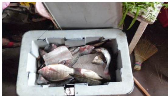
Figure 2: The cool boxes

In the fish circuit, the volumes sent by the fishermen are done so on a just-in-time basis: there is no stock. Fish are caught in the morning and sold the same day or, at the latest, the next morning because of the lack of any reliable means of conservation. The fish are transported by car, motorcycle or boat and are placed in cool boxes to prevent them from going off, although this is not always possible. The quantity of cool boxes that can be transported is limited either by vehicle capacity or by the driver's decision to take passengers and freight. Cool boxes are well worn and not completely sealed, thus affecting the freshness of the fish. Hence, aside from a transport limited to small quantities, disruptions are considered normal, as is the lack of reliability of devices and products. People are used to living with many objects that are out of order.