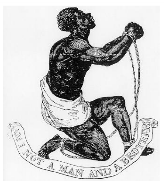
Figure 9.1. Wedgwood's anti-slavery medallion for the Committee for the Abolition of the Slave Trade originally designed in 1787