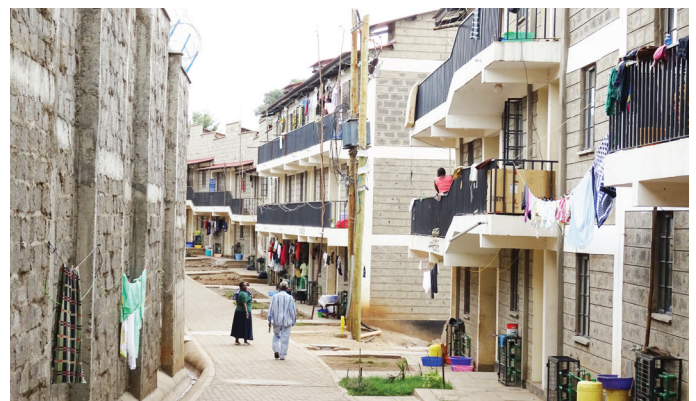
The new units in Soweto East, Kibera, January 2016

Yet, the project did not escape claims of irregularities during enumeration. Many interviewees testified of the numerous conflicts arising during the counting process. Common stories are related to tenants presenting themselves as structure owners and vice versa and people being absent during enumeration. Most of the issues were settled during the process of verification of data, which was presented to the communities or through the three-tier grievance mechanism. The grievance process allows claims to be raised and referred to the grievance segment committee, composed of community members supported by a REMU law clerk. Each case is heard and investigated according to a pre-established questionnaire and a decision is made and communicated to the concerned individuals.