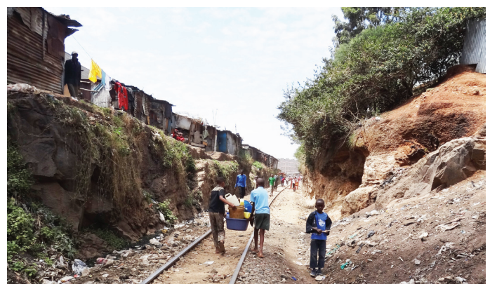
People carrying their baskets on the day of relocation in Soweto East, September 2015

"The conflict about Nubians as it was the Nubians have always laid claim for ownership of the entire Kibera. [...] And so when it came to projects in Kibera, they would see them as sometimes as interference on their land or rather as also they want to, by virtue of the claim they lay on the land, they also want to benefit from whatever project, regardless of whether it is targeted for them or not. [...]. They were even flouting that from every 5 PAPs, the ratio should be 2 Nubians and 3 non-Nubians."