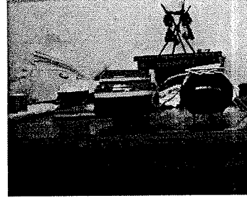
Plate 1. Bowls and some other implements used by mendicants belonging to the A(ñ)calagaccha

A terminological clarification is perhaps not out of place: I use the term 'group', admittedly a rather vague word, or 'order'. Neither the term 'school' nor the term 'sect' can be deemed adequate in such a case, because, as will be seen, firstly the A(ñ)calagaccha is a subdivision of the Śvetāmbaras and basically agrees with all the tenets Śvetāmbaras generally admit, secondly their followers distinguish themselves from other gacchas (such as the Kharatara- or the Tapā-) much more on matters of praxis than on their doctrine or philosophical options: the differences between these gacchas are not fully those which can be seen between the Buddhist schools of the Sarvāstivādins and the Mahāsāṃghikas. 1 Hence the expression 'monastic traditions' (favoured by E. Zürcher) or 'ascetic lineage' (see J. Cort and L. A. Babb) 2 would be more appropriate for designating them. As a matter of fact, the existence of several of these groups is not sufficient to endanger and mask the unity of the Jain community as a whole. On the contrary, by providing frames for the interpretation of scriptures and transmission of learning, they keep the Doctrine away from the danger of somnolence and stress its basic unity. 3