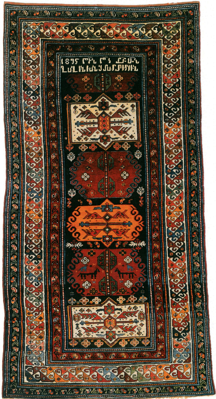
Fig. 4: Carpet style Kedim Ganja ('Ancient Ganja') from Ganja (Azerbaijan) dated 1895, with dedication in Armenian. 17