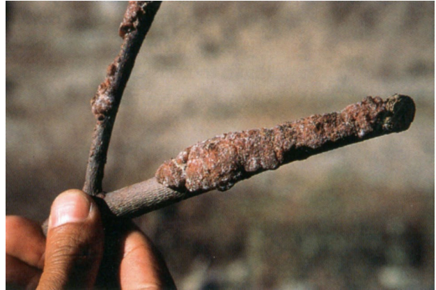
Fig. 7: Kerria lacca crust on twig.

The Indian scale insect, Kerria lacca (Fig. 7), forms encrustations on branches; one breaks the twigs with the encrustation into pieces (and puts them into water to use the dye). This substance is called lākṣā in the Sanskrit literature and described much like a mineral, probably because the crusts are not seen as being composed of individual insects. The word kṛmi - ‘worm’, on the other hand, is not used for the scale insect. Assumptions that Armenian karmir , or