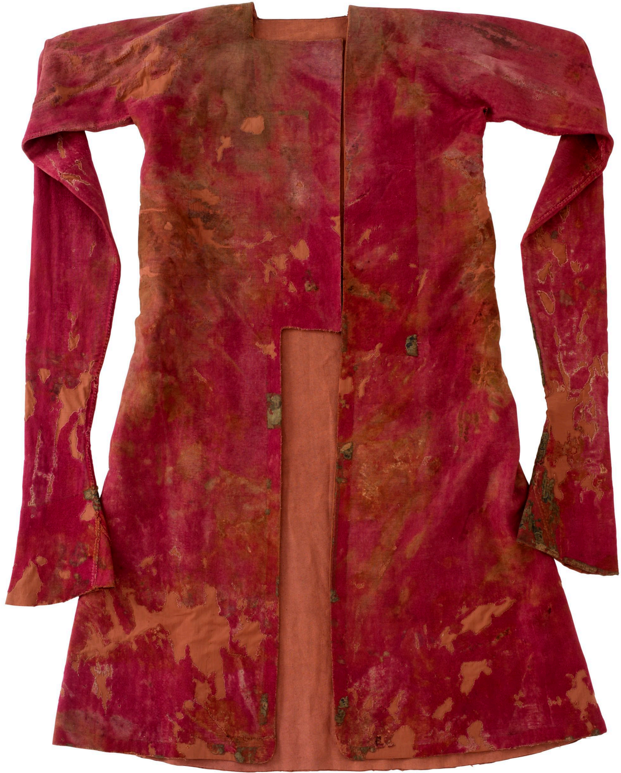
Fig. 5: Cashmere caftan (6 th /7 th c.) found in Antinoë (Egypt). Red dye: Porphyrophora hamelii .