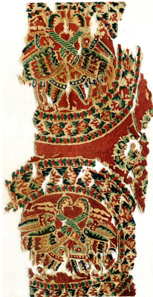
Fig. 10: Tapestry fragment found in Egypt (Antinoë). Red dye: Porphyrophora .

Pfister identified the red of this tapestry as well as a number of other textiles 31 as being dyed with