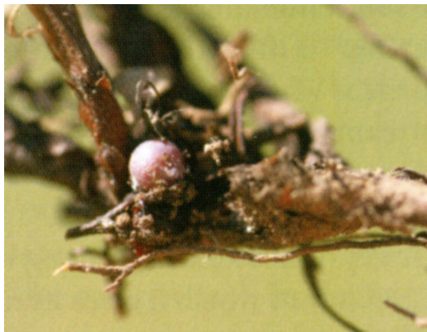
Fig. 9: Porphyrophora polonica on grass root.