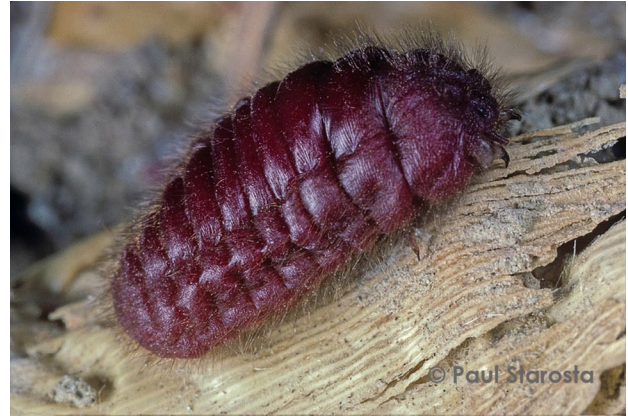
Fig. 2: Porphyrphora hamelii (original length max. 1 cm).

In the remaining parts of the Old Testament, the series of blue, purple and crimson or scarlet reoccurs