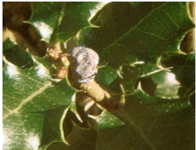
Fig. 8: Kermes vermilio on Mediterranean oak.

Persian qirmiz , might be of Indian origin, are thus rather unlikely. 27