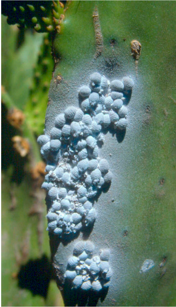
Fig. 6: Dactylopius coccus on cactus.

scale insect, Dactylopius coccus (Fig. 6), which was widely used before synthetic colours were invented, but it cannot play a role here because it came from Latin America too late to be of relevance.