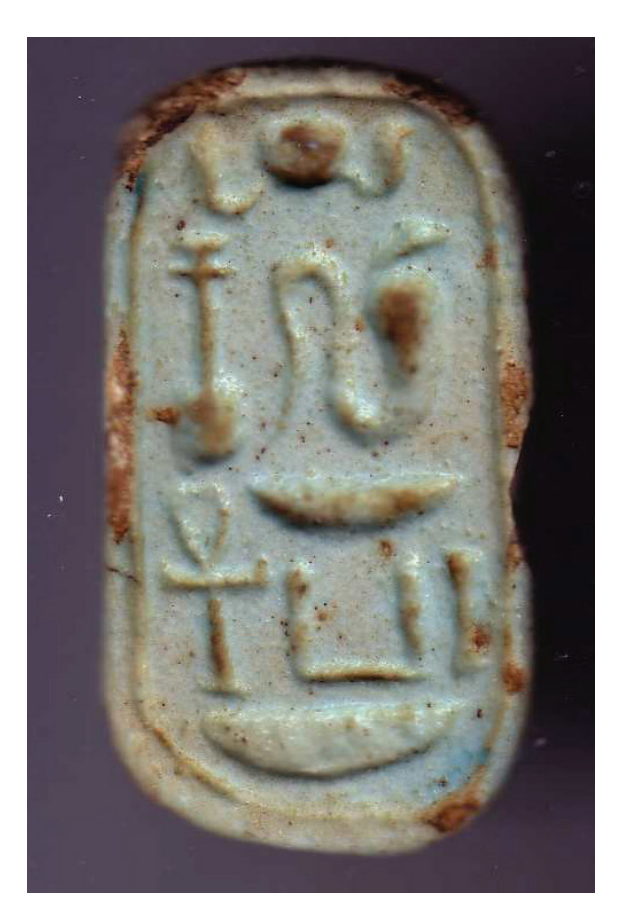
Figure 5. b) Seal (private collection).