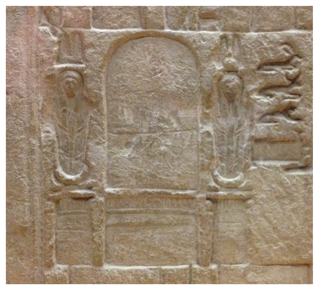
Figure\ 2.\ Two\ anguiform\ statues\ with\ female\ faces\ on\ either\ side\ of\ a\ stella\ (detail\ of\ the\ relief\ Florence\ inv.\ 5412).\ Photo\ J.\ Masquelier-Loorius.