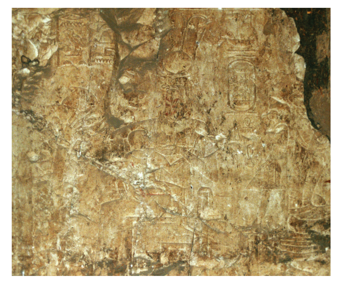
Figure\ 4.\ Anthropomorphic\ nursing\ image\ with\ a\ snake's\ face\ (The ban\ tomb\ 48).\ Photo\ J.\ Masquelier-Loorius.