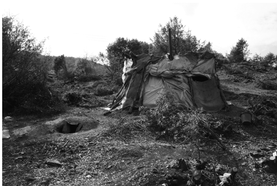
Fig 20.1 Photo of the dwelling

The sampled structure is Mouha Baghbou's temporary dwelling located in Naour, at an altitude of 1400 m (Middle Atlas Mountains—Morocco). Mouha is an