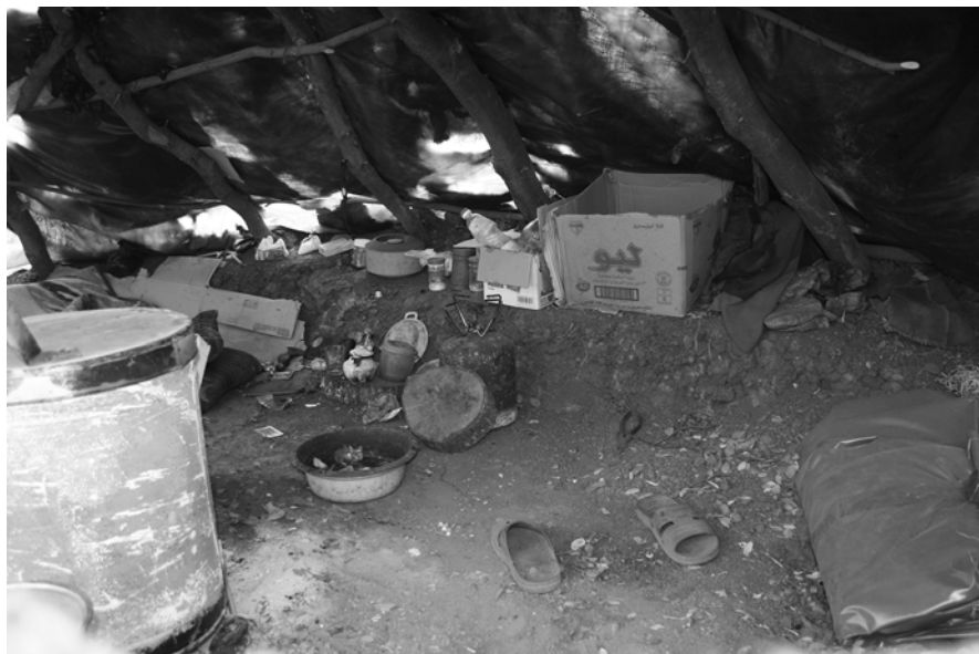
Fig. 20.3 Interior of the dwelling