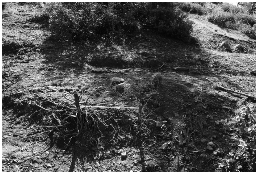
Fig. 20.4 Photo of the dwelling 1 year after it was abandoned