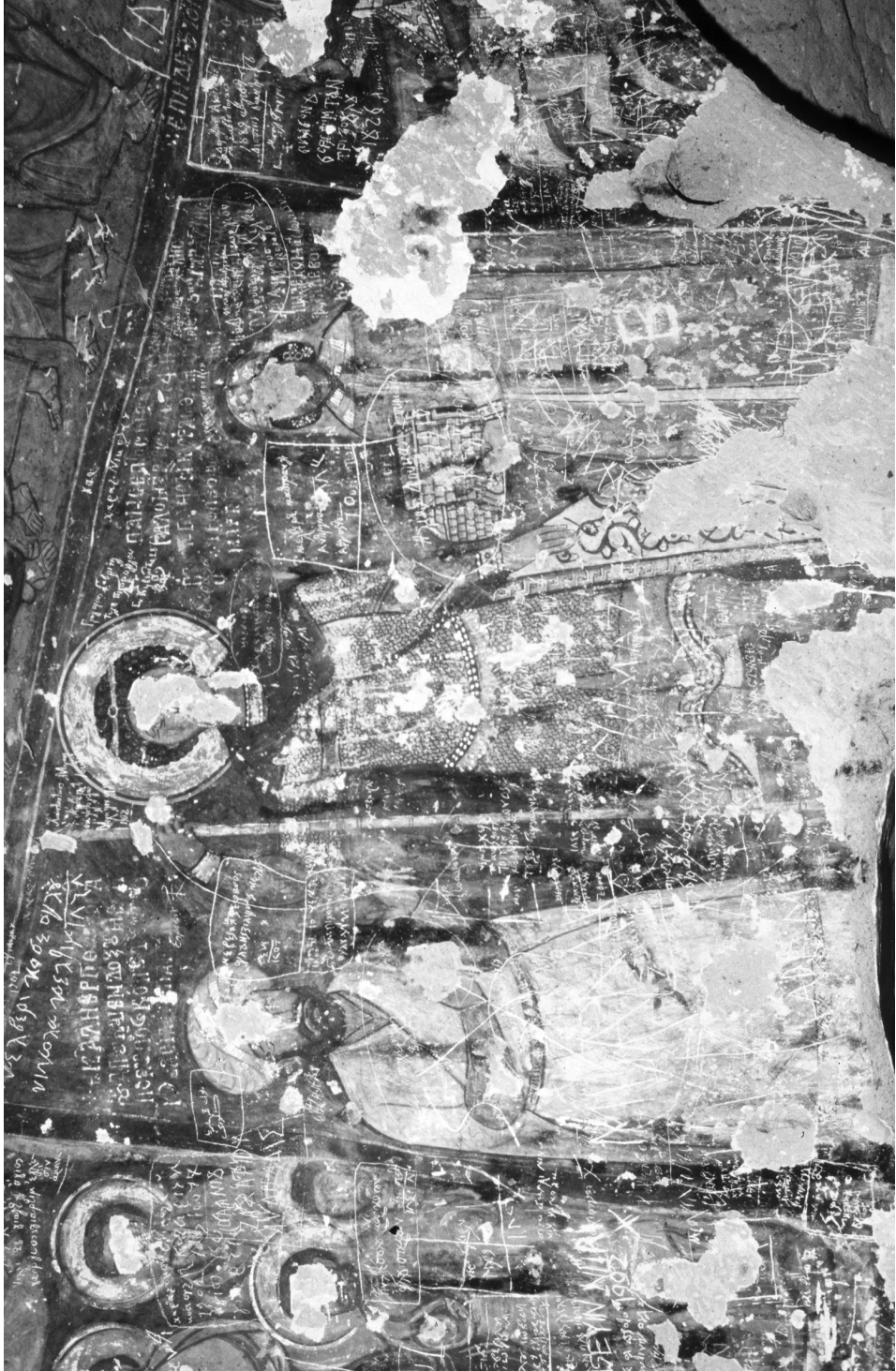
Fig. 3: Saint George church in Belisirma.