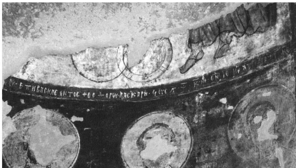
Fig. 1: Karşı Kilise.