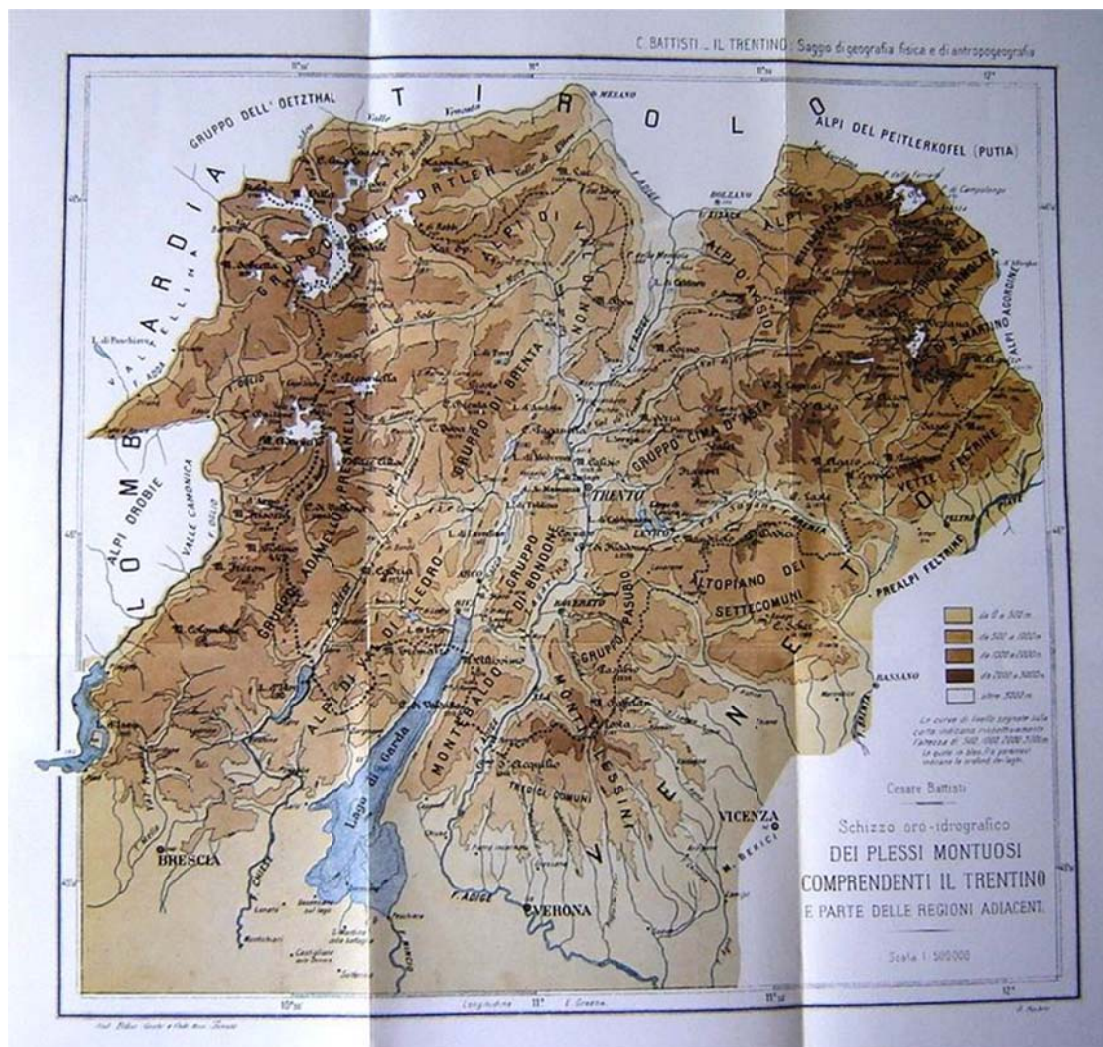
Fig. 2 The ‘historical region’ of Trentino (Battisti, 1898)

If Battisti is still known in Italy more as a ‘national hero’ than as a geographer, the analysis of his Trentino ‘anthropogeography’ clearly shows his commitment to fashioning a geographical representation of his region which could be of service to, and anticipated, its independence from Austria. There Battisti stresses firstly the region’s historical, cultural and ethnic features for this openly political purpose. Applying the principle of the relativity of borders and regionalisation, a method mirroring those used by both Ratzel and Reclus, Battisti posits the intrinsically mobile nature of political and administrative boundaries (Ferretti, 2014c), independently of the deep political differences between the French anarchist and the German conservative. Thus, he distinguishes two regions on the southern side of the Brenner watershed, Trentino and Alto Adige (South Tyrol), on the basis of ethnic and linguistic criteria, defining Trentino as an ‘historical region’ (Battisti, 1898:4), not a natural one. Since this Italian-speaking region did not correspond to any hydrographical basin, Battisti’s criterion of proposing an established regionalisation belonged to what we might call today ‘cultural difference’ (Du Gay and Hall, 1996).