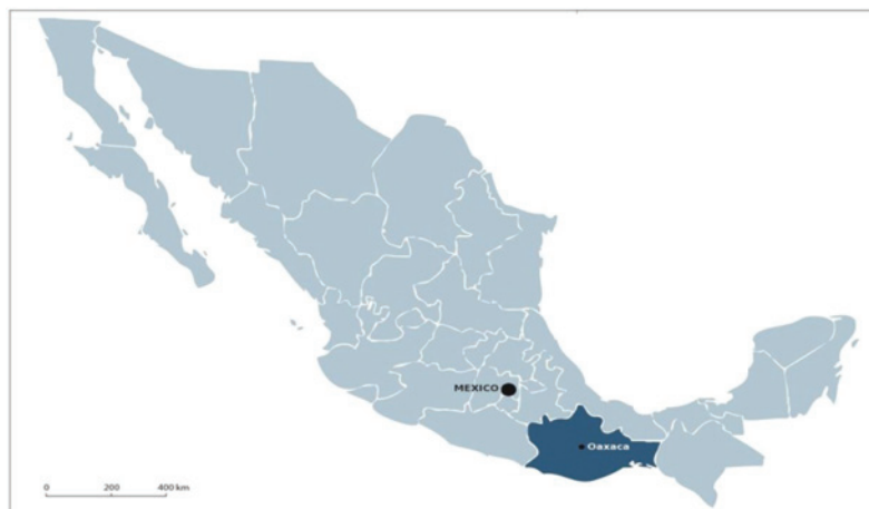
Fig. 1: The state of Oaxaca, Mexico

horses, and, more recently, cars. The women have always worked as fortune tellers, whether one hundred years ago or today. Group members are closely connected and intermarry with other Roma living in Mexico; marriages with outsiders are also frequent.