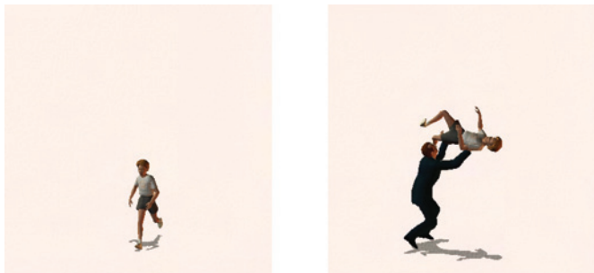
Fig. 2: Stimuli by Skopeteas et al. (2006)

In order to explore the topic of attributive constructions, I used the questionnaire on the Spanish distinction between ser and estar , designed by Geeslin and Guijarro-Fuentes (2008). The four Romani speakers were first asked to choose among the two Spanish copulas in several pre-constructed sentences which followed a paragraph-long context. For the needs of the present study, they were then asked to translate the clauses into Romani. This allowed me to compare Spanish and Romani attributive constructions in identical contexts.