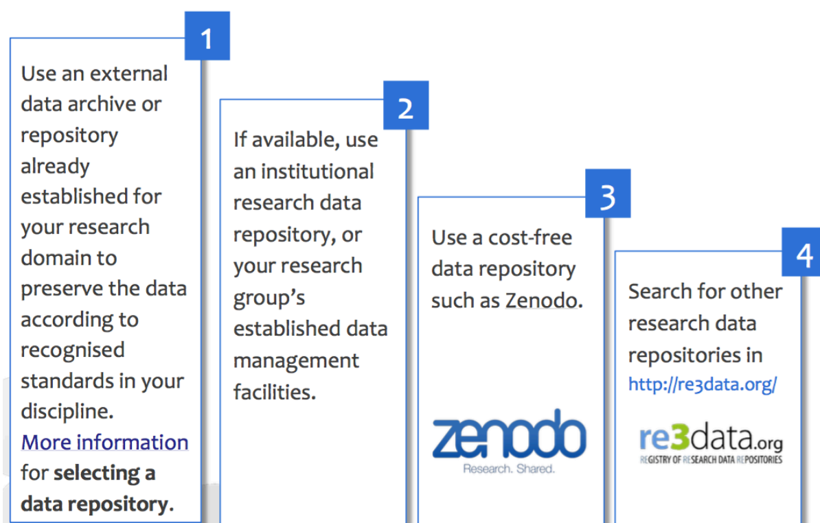
Figure 5: Steps to find a data repository

Figure 5 shows the steps that are recommended by the H2020 OpenAIRE project for selecting a research data repository 40 .