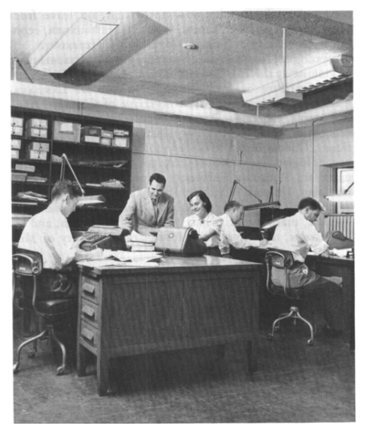
Figure 3: Cowles Commission Computational Laboratory in Chicago.