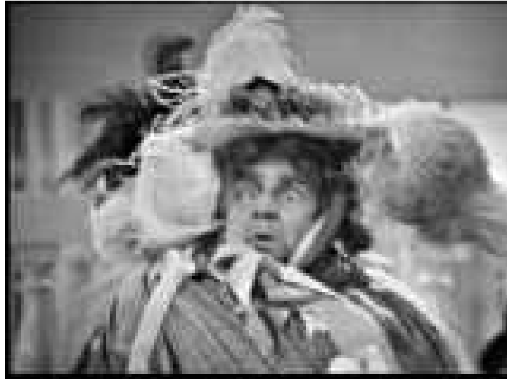
12. Falstaff disguised as the old woman of Brenford

The Taming of the Shrew (Pierre Badel, 1964)