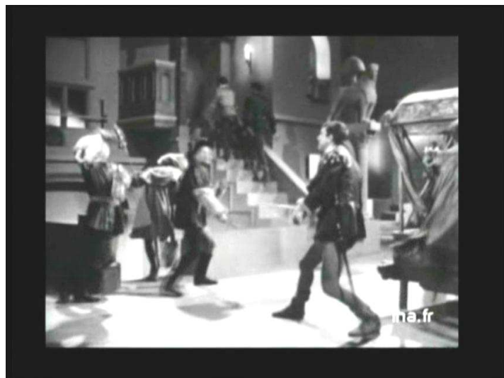
13. Filming The Shrew in the tradition of the swashbuckling movie

The Taming of the Shrew (Pierre Badel, 1964)