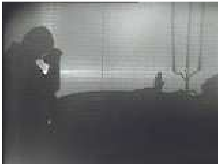
7. Claudio paying homage to Celia (Hero)