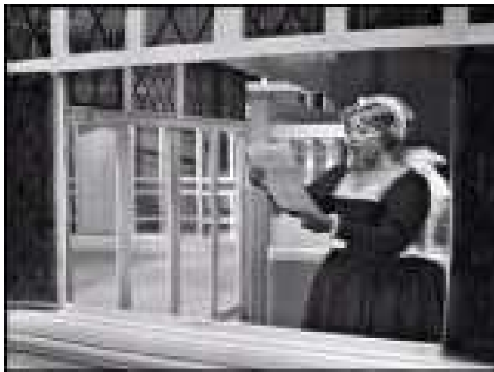
9. The walls revealing their artificiality