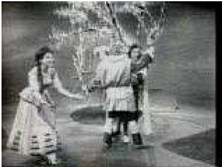
5. Sir Toby pretending to be a tree during the eavesdropping scene