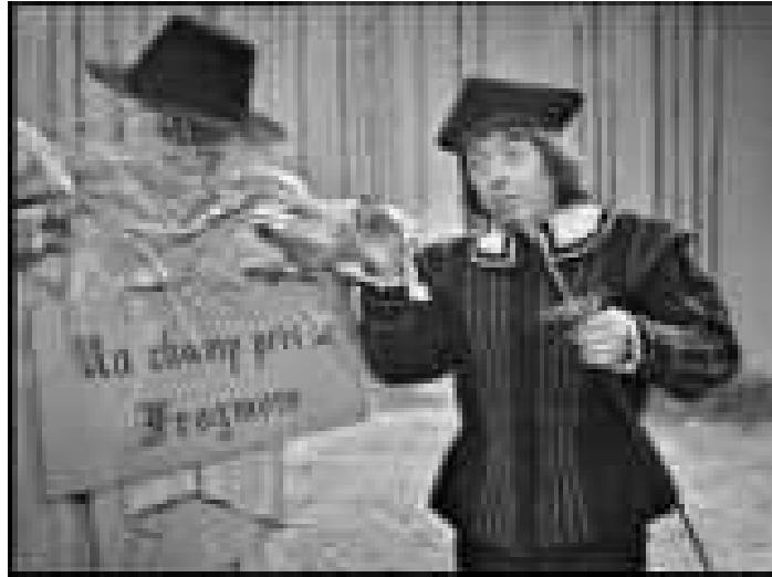
10. The scarecrow bearing a different sign to indicate each location (“Un champ près de Frogmore”)