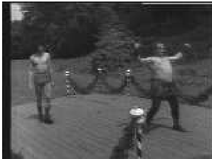
17. Orlando about to fight Charles the Wrestler