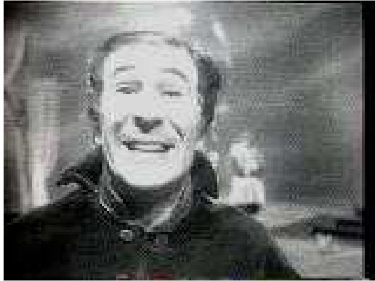
4. Jean-Pierre Marielle as Malvolio