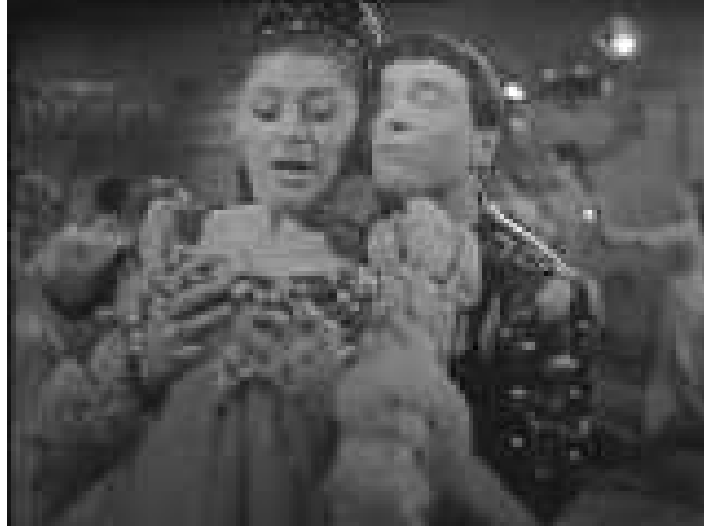
8. Borachio's bawdy game with Margaret