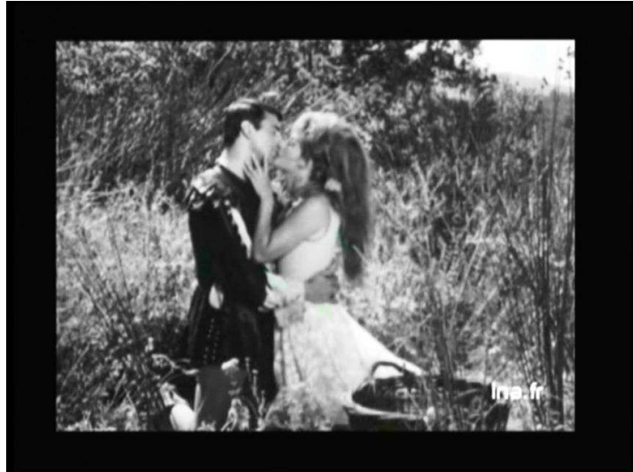
16. The romantic kiss concluding the film