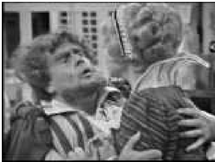
11. Jean Le Poulain as Falstaff wooing Mrs Ford