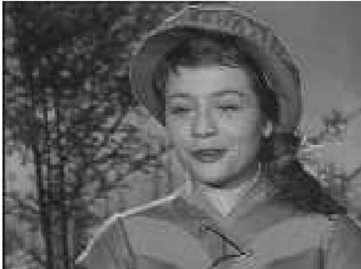
2. ... Annie Girardot played Viola...