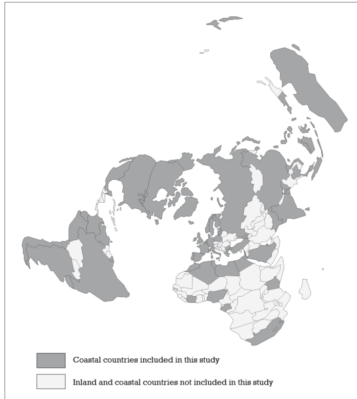
Figure 17.1: Countries included in this study