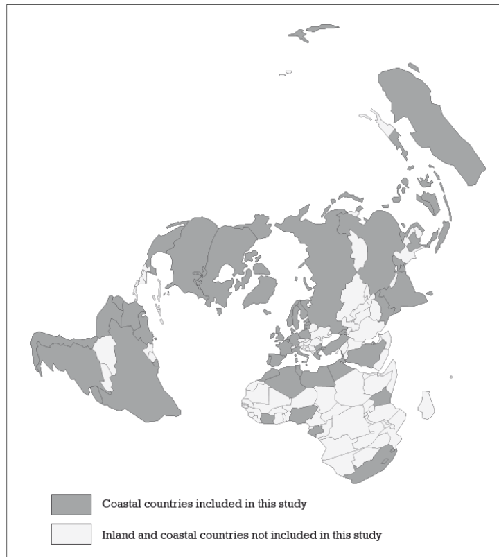
Figure 17.1: Countries included in this study