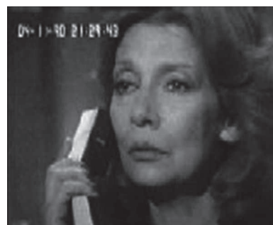
Plate 11: Lauriot and Gerty receiving anonymous phone calls in Josée Dayan's 1980 L'Embrumé