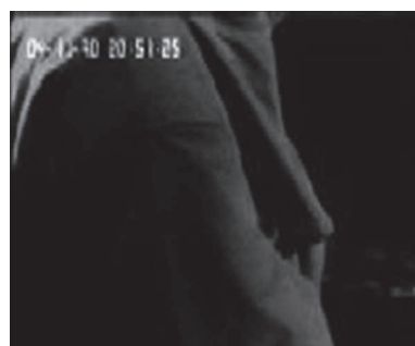
Plate 13: The rain-coat-clad figure in Josée Dayan’s 1980 L’Embrumé