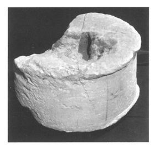
Fig. 5.9 Marble base for statue of Lysimache. Athens, Acropolis IG IP 3453.