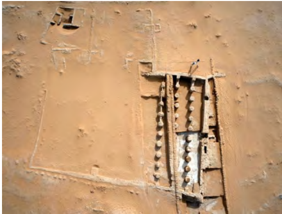
Figure 25. Aerial view of the mosque at al-Yamâma (© Th. Sagory, French-Saudi Archaeological Mission in Yamâma).

Moreover, when the sounding was extended, the corner of a monumental building appeared. Its extensive excavation in 2012 led to the discovery of the great mosque of the site (Fig. 25). If its attribution to the Abbasid period proves to be correct, it will provide valuable data on the religious architectural tradition in Central Arabia at that time.