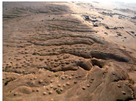
Figure 24. Aerial view of the tumuli field at 'Ayn al-Dila'.

Finally, of great interest are the Late Pre-Islamic and Early Islamic periods, whether from a historical or archaeological point of view. As the setting of memorable events, the region, then named al-Yamâma, has been vividly described in the early Islamic sources. The most outstanding episode is without doubt the rise among the Hanîfa tribe of the prophet known in the Arabic tradition as Musaylima the Liar, who constituted a serious threat to the incipient Muslim community.