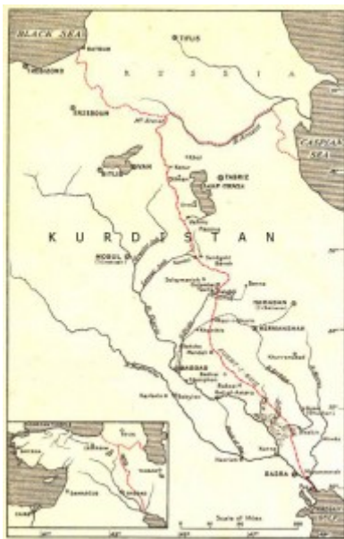
Kurdistan (G.E. Hubbard, From the Gulf to Ararat, 1917)

This independent set of mind eventually brought the same fate upon Abdāl Xān as it had upon his grand-father. Driven out of the city by Malak Aḥmad Pāšā, governor of Vān, in 1065/1655, before coming back upon the latter's dismissal in 1066/1656, Abdāl Xān himself was eventually dismissed by the Porte in 1076/1665 and replaced by his son Badr al-Dīn. The Khan was exiled to Istanbul, where it is said that he led a quiet life until he was unexpectedly murdered upon the orders of Sultan Meḥmed IV (r. 1058-99/1648-87) in 1078/1668 (Dankoff 1990: 11, n.2).