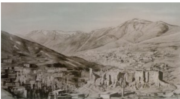
View of Bidlīs (P. Müller-Simonis, Du Caucase au Golfe Persique, 1892)

The political situation of the principality of Bidlīs at the time Šaraf Xān wrote the Šarafnāma remains unclear; furthermore, this situation seems to have quickly evolved in the very years when the different versions of the work were composed. We can only assert that Bidlīs was then nominally an Ottoman yurtluk-ocaklık (that is a semi-autonomous hereditary principality with specific privileges, notably regarding taxes; see Dankoff 1990: 14-15). Whether Šaraf Xān was still de facto ruler of the emirate cannot be determined at the moment.