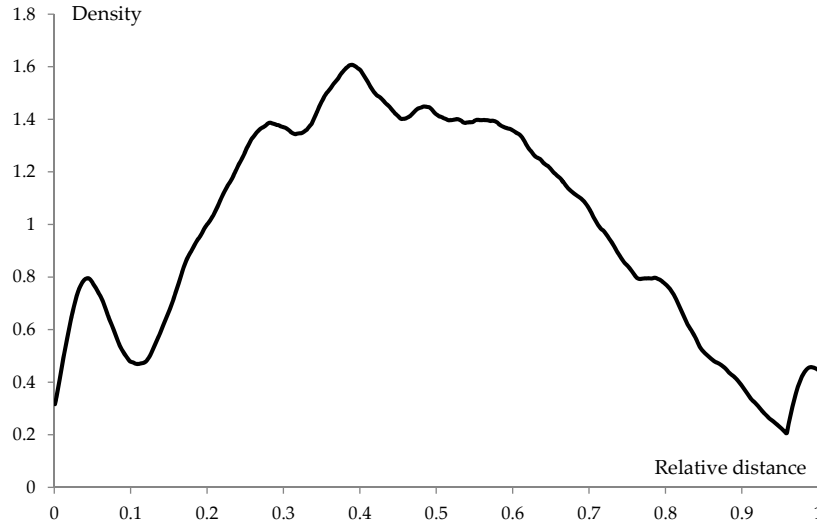
Figure 1: Probability distribution function of the relative distance for new constructions, French urban areas 2006-2012

Notes: All years of data used. 218,657 observations. For each new construction, we compute the distance between the centroid of its municipality and the centroid of its urban area and divide by the greatest observed distance for any new construction in this urban area.