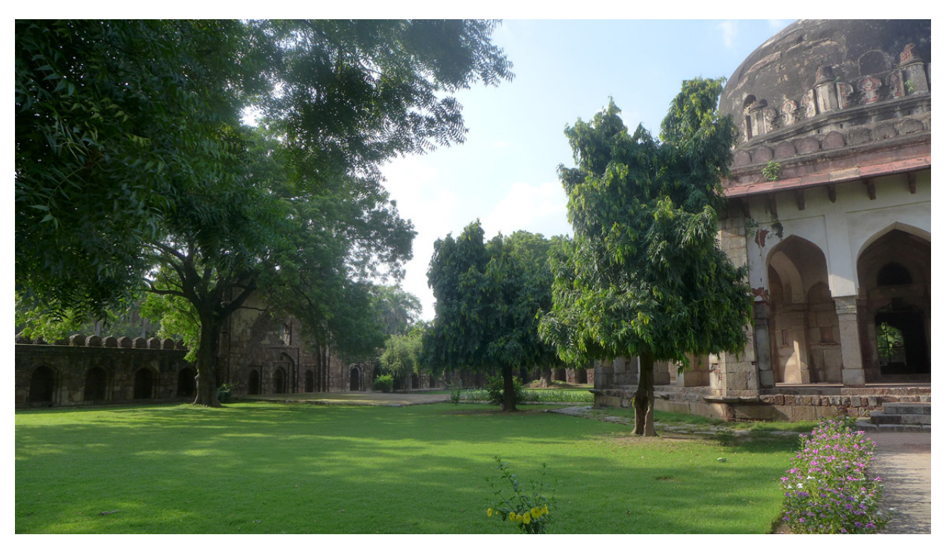
Pic 6: Mausoleum of Sikandar Lodi, c. 1517, Lodi Garden. Photo: Yves Porter, 2015.

1547, a very similar scheme will be used for the tomb of Issa Khan, as we will see below.