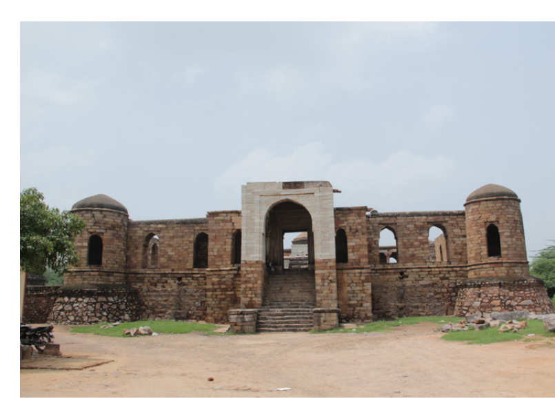
Pic 1: Sultan Ghari, built 1231.

Qutb al-Din Aybak (1206-1210 CE) the actual founder of Delhi's sultanate, never assumed the title of sultan. He was buried in a garden at Lahore, although not much is known