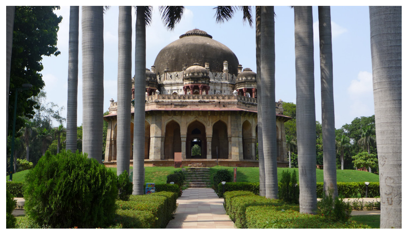
Pic 5: Mausoleum of Muhammad Shah, c. 1446, Lodi Garden.

originally set in a larger enclosure, thus totalizing a length of approximately 225 m. The area is now completely invaded by encroachments and anarchic constructions.