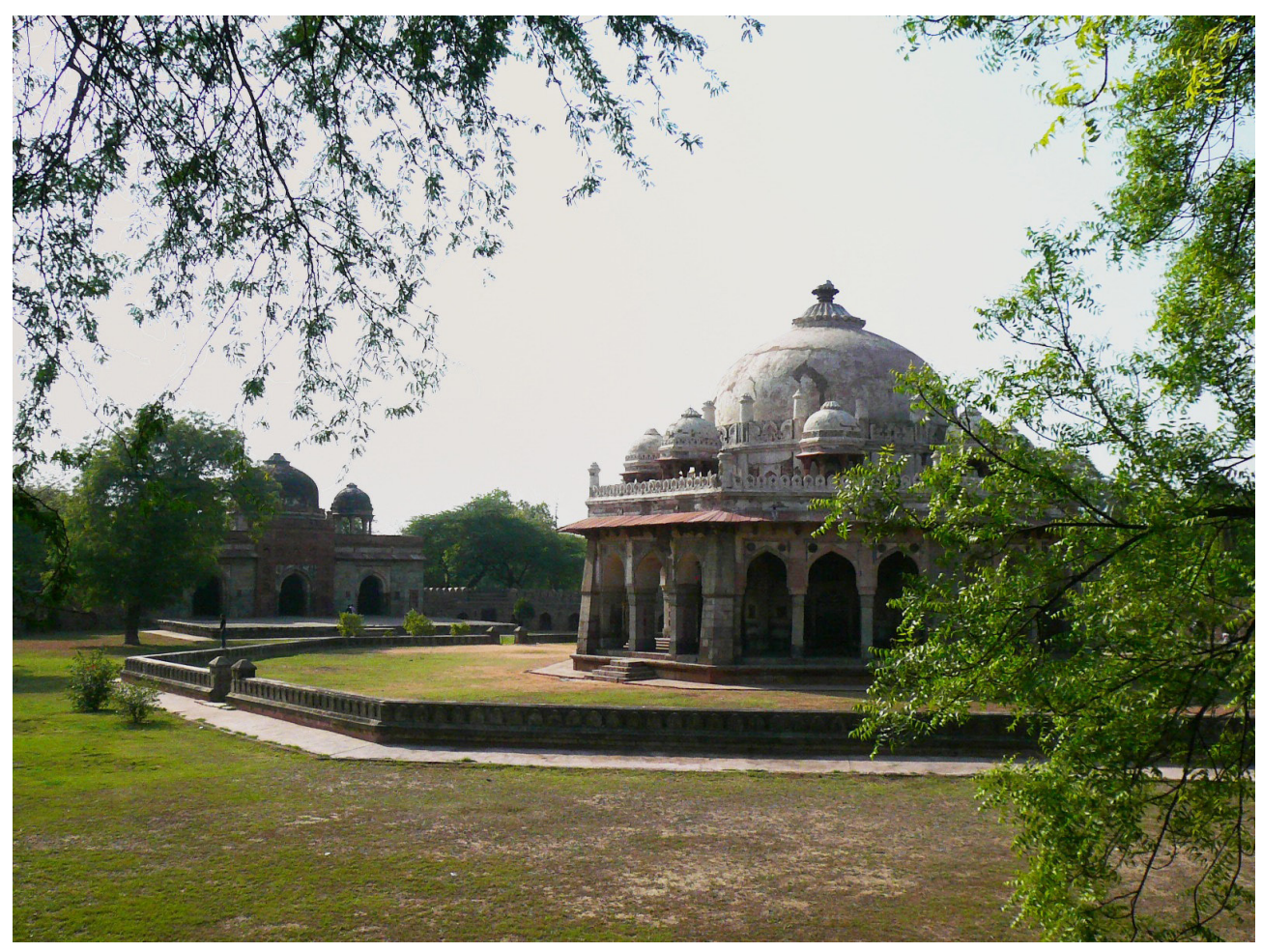
Pic 7: Mausoleum of Issa Khan, c. 1547. Photo: Yves Porter, 2008.

octagon. Its architectural scheme is very similar to the Sayyid and Lodi tombs, although more lavishly decorated with glazed tiles. The western side of the enclosure holds