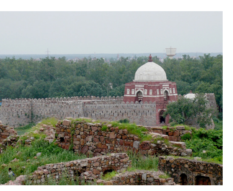
Pic 2: Ghiyath al-Din Tughluq mausoleum, c. 1325, Tughluqabad. Photo: Yves Porter, 2007.