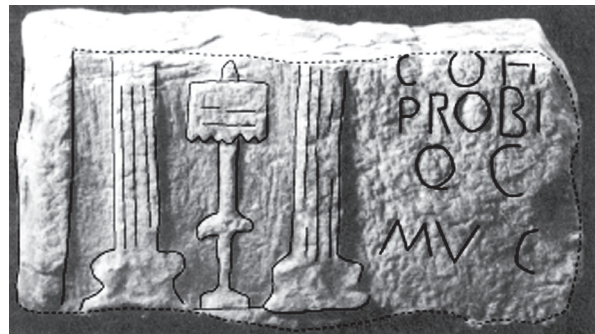
Fig. 5. The Chesterholm plaque (= RIB 1710) showing a vexillum standing between two columns (drawing by M. Reddé, after TÖPFER 2011: pl. 122, RE 21)