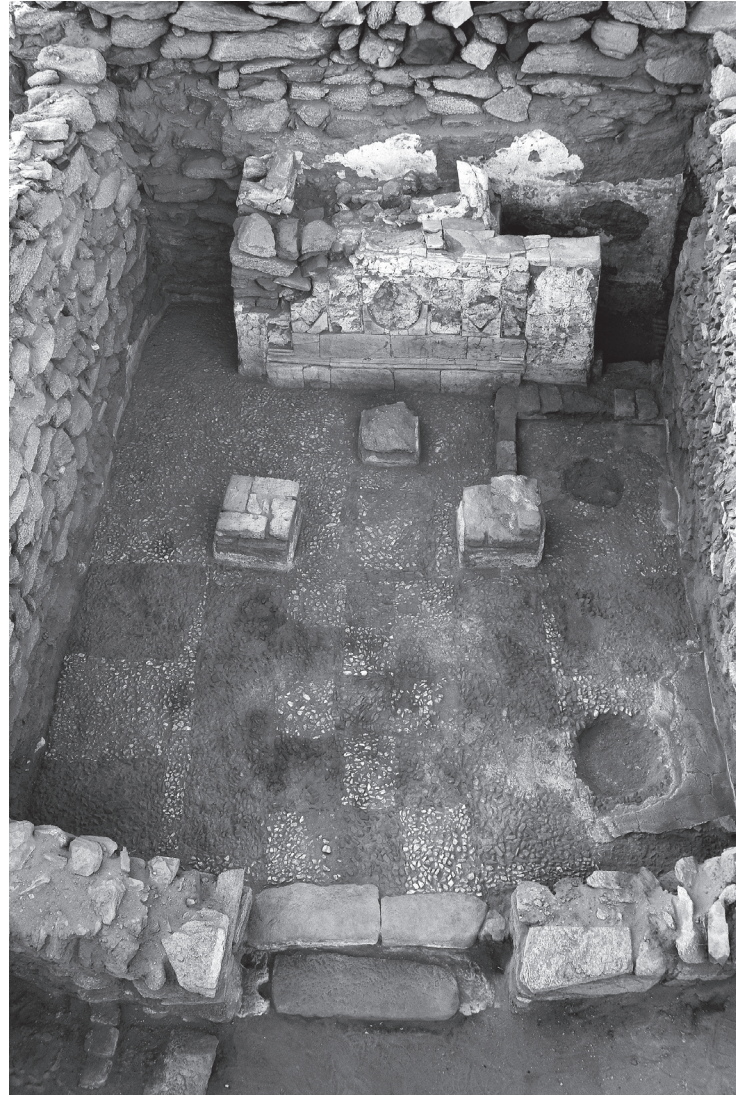
Fig. 2. General view of the chapel of Dios/Iovis

The existence of a podium in a military aedes has already been proposed several times in the learned literature, in view of the various discoveries of which T. Sarnowski himself drew up a list that should probably be updated now (SARNOWSKI 1992: note 9). He cited in particular Castell Collen (NASH-WILLIAMS 1969: 159), Caerleon ( Archaeologia Cambrensis 1970: 14, fig. 2), Chesterholm (BIRLEY, RICHMOND, STANFIELD 1936: 229), Risingham (RICHMOND 1940: 110) and Aalen (PLANCK 1984: 22). The best-conserved example architecturally is probably the barracks of the vigiles at Ostia, which has, as at Iovis, side stairs (SABLAYROLLES 1996: fig. 4). This was also the case at Risingham and it is known that this architectural arrangement was still operative in the legionary camp of Lejjun (Jordan) in Late Antiquity. There the podium ran around the sides of the room, as indeed it did at Caerleon, and was served by both a side and a central staircase, facing the apse