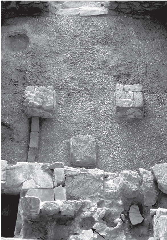
Fig. 3. View of the podium from the rampart. The central hole in which the standard could be fitted is arrowed. The wooden pegs cannot readily be seen