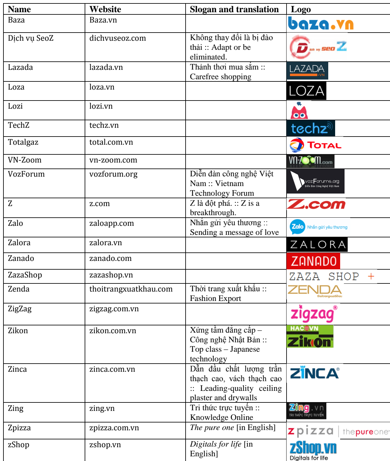
Table 1: A list (in alphabetical order) of popular websites whose address contains the letter Z.

A special case is that of companies named “Z”. The company Z Pizza , boasting no less than three Zs in its name, ( http://zpizza.com.vn/ ) has a supersize announcement – an eye-catcher in a cityscape where ads remain few – on the walls of the shopping mall Vincom Center Ba Trieu. At its opening in 2004, this high-notch shopping mall was the tallest building in Hanoi; as a Vietnamese-owned private company, it is a symbol for aspiring entrepreneurs and young professionals. The message displayed on the advertisement is “Thương hiệu đến từ Mỹ” ( An American trademark ), emphasizing that the company delivers the real thing, as if straight from the USA.