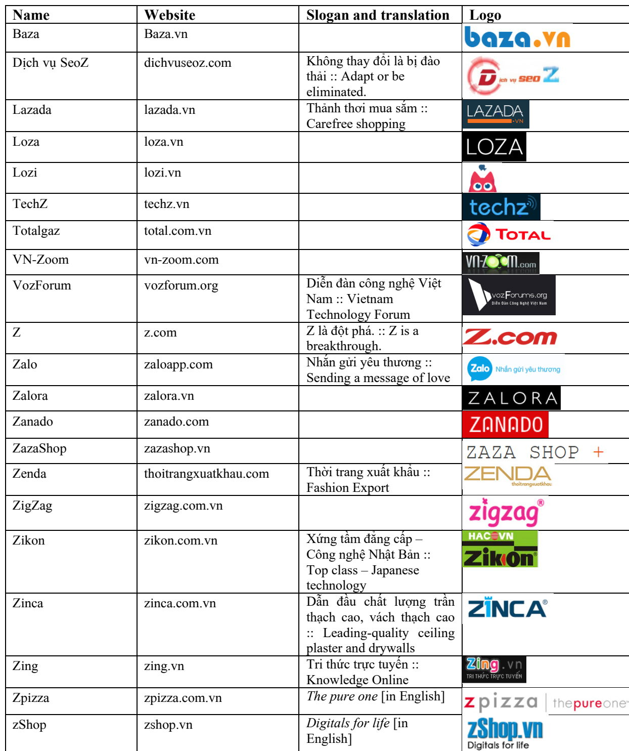
Table 1: A list (in alphabetical order) of popular websites whose address contains the letter Z.

A special case is that of companies named “Z”. The company Z Pizza , boasting no less than three Zs in its name, ( http://zpizza.com.vn/ ) has a supersize announcement – an eye-catcher in a cityscape where ads remain few – on the walls of the shopping mall Vincom Center Ba Trieu. At its opening in 2004, this high-notch shopping mall was the tallest building in Hanoi; as a Vietnamese-owned private company, it is a symbol for aspiring entrepreneurs and young professionals. The message displayed on the advertisement is “Thương hiệu đến từ Mỹ” ( An American trademark ), emphasizing that the company delivers the real thing, as if straight from the USA.