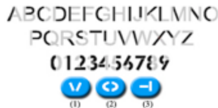
Figure 1: The UniGlyph character set and the associated input keys.

The UniGlyph keypad contains three shape keys and one command key used to jump to the different input modes and to select the expected word.