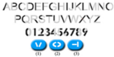
Figure 1. The UniGlyph character set and the associated input keys: (1) diagonal-shape key, (2) loop-shape key, (3) straight-shape key.

an adaptation for smart objects, particularly for connected watches. For more details, refer to the original articles.