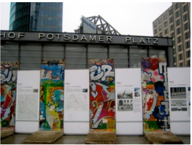
Photo 3. Preserved sections of the Berlin wall and the panels on the history of the wall in front of the subway station at Potsdamer Platz.

It is not difficult, however, for the attentive observer to notice that a geopolitical wall continues to divide the city. In the West, the scars of the Second World War, symbolized by the bombed-out Kaiser Wilhelm Memorial Church and the more recently reconstructed Reichstag – with its glass dome symbolizing transparent democracy, serve as a continual reminder of the stain of Nazism on German history. In the East, little trace remains of the Nazi influence, even though the past is now somewhat recalled in the recently rebuilt Rykestrasse synagogue in the city's Jewish quarter.