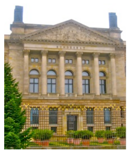
Photo 7. The Bundesrat representing Germany's 16 states.

The tearing down of the Berlin Wall expanded the free space accessible to West Berliners. Many moved outside of the city and into areas formerly controlled by the GDR. Like when the wall first went up, this out-migration – along with a weak birth rate – caused the population to decline.