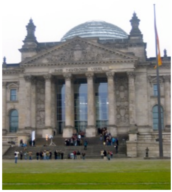
Photo 5. The Bundestag, Germany's lower house of assembly, is located in the refurbished and redesigned Reichstag building.

The two sides of the city also have different architecture. The West, which was about five times the size of Paris, had less population pressure than East Berlin. This large amount of space meant that high rises were practically nonexistent across its 484 km2 territory. The East, on-the-other-hand, sought to demonstrate its 'modernity' by transforming the Alexanderplatz with structures like the Fernsehturm and building layers of similar looking suburbs in the city's outlaying areas.