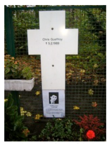
Photo 2: Near the Brandenburg Gate, the tomb of one of the last people killed while trying to cross the Berlin Wall: Chris Geoffroy, February 5, 1989 © Photo: Gérard-François Dumont – 2007.

Not everyone was lucky in their attempt to escape. 588 people died while trying to cross over into West Berlin. Some of their modest tombs can be found near the Brandenburg Gate on the western side. Among the last of these victims was Winfried Freudenberg (13 February 1989) who died after trying to escape in a homemade plastic balloon.