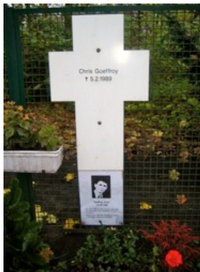
Photo 2: Near the Brandenburg Gate, the tomb of one of the last people killed while trying to cross the Berlin Wall: Chris Geoffroy, February 5, 1989 © Photo: Gérard-François Dumont – 2007.

Not everyone was lucky in their attempt to escape. 588 people died while trying to cross over into West Berlin. Some of their modest tombs can be found near the Brandenburg Gate on the western side. Among the last of these victims was Winfried Freudenberg (13 February 1989) who died after trying to escape in a homemade plastic balloon.