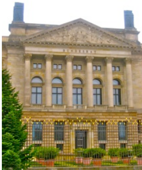
Photo 7. The Bundesrat representing Germany's 16 states.

The tearing down of the Berlin Wall expanded the free space accessible to West Berliners. Many moved outside of the city and into areas formerly controlled by the GDR. Like when the wall first went up, this out-migration – along with a weak birth rate – caused the population to decline.