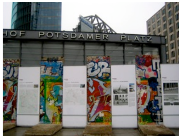
Photo 3. Preserved sections of the Berlin wall and the panels on the history of the wall in front of the subway station at Potsdamer Platz.

It is not difficult, however, for the attentive observer to notice that a geopolitical wall continues to divide the city. In the West, the scars of the Second World War, symbolized by the bombed-out Kaiser Wilhelm Memorial Church and the more recently reconstructed Reichstag – with its glass dome symbolizing transparent democracy, serve as a continual reminder of the stain of Nazism on German history. In the East, little trace remains of the Nazi influence, even though the past is now somewhat recalled in the recently rebuilt Rykestrasse synagogue in the city's Jewish quarter.