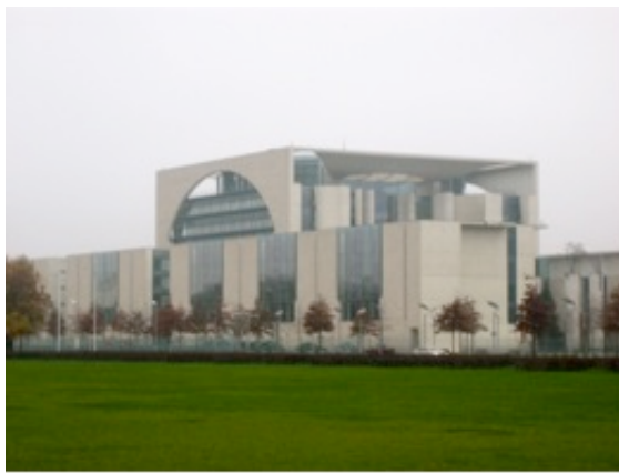
Photo 6. The New Chancellery in Berlin built after reunification in 1990.