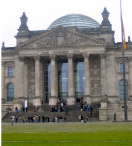
Photo 5. The Bundestag, Germany's lower house of assembly, is located in the refurbished and redesigned Reichstag building.

The two sides of the city also have different architecture. The West, which was about five times the size of Paris, had less population pressure than East Berlin. This large amount of space meant that high rises were practically nonexistent across its 484 km 2 territory. The East, on-the-other-hand, sought to demonstrate its 'modernity' by transforming the Alexanderplatz with structures like the Fernsehturm and building layers of similar looking suburbs in the city's outlying areas.