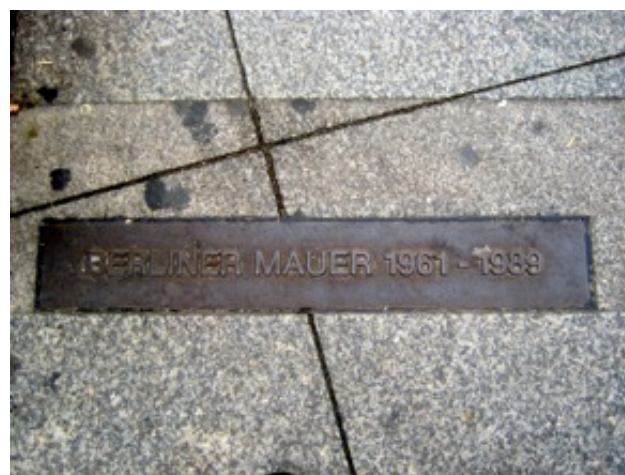
Photo 4. A plaque marking where the wall's location near Potsdamer Platz. The plaque reads "Berlin Wall 1961-1989".