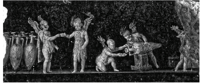
Fig. 1. Pompeii, Casa dei Vettii , room q, north wall; Cupids tasting wine.

There were three potential viewers of the frieze: the patron, the painter, and then the viewing guest or visitor. We will focus on the first two of these. Indeed, despite actual difficulties to access the house, it was possible to spend hours observing each scene in any of their details; most probably only the painters who made the frieze had been able to do so previously. This (far too) detailed vision, which will be the basis for the necessary description of each panel of the frieze, ought to be simplified in a second time to try to get not only the patron's, but more specifically the viewer's point of view. Going back and forth between a punctilious description and a broader vision will offer a comprehensive reading of the frieze and highlight the existence of a technical culture in the Pompeian elite through it.