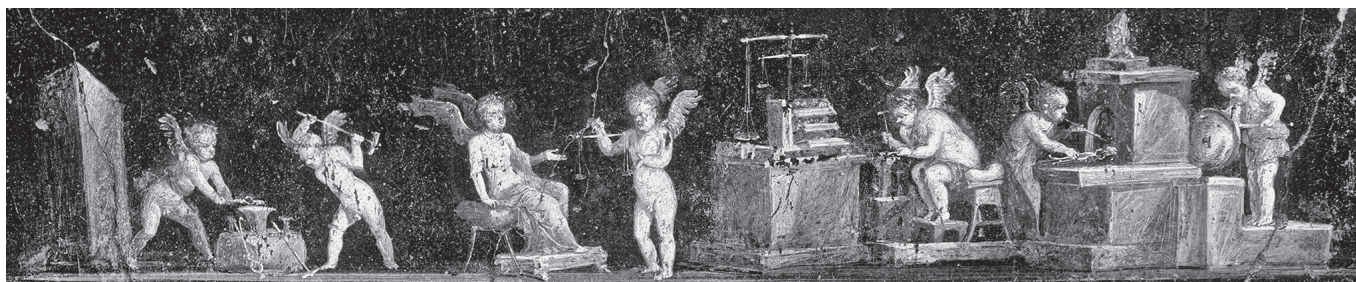
Fig. 3. Pompeii, Casa dei Vettii , room q, east wall; metallurgist Cupids.

Given this and handling of fabrics in each scene, or the suggestion of their manipulation, the illusion is achieved: that is of a scene generally presenting the preparation of coloured fabrics rather than a real or practical illustration of actual production. This suggests, therefore, the adaptation of compositional schemes by the painters in order to fulfil the patron's iconographic wishes.