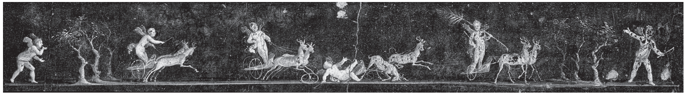
Blue White Red Green