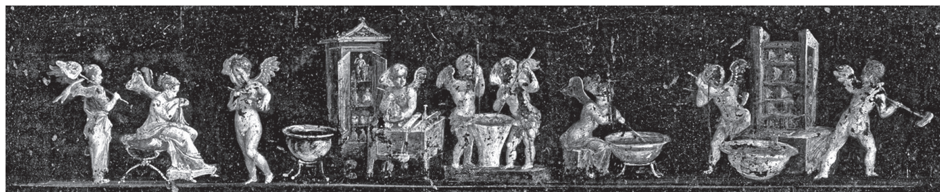
Fig. 5. Pompeii, Casa dei Vettii , room q, east wall; Cupids and Psyche preparing perfumes.

quently reworked, doubled over, with its head to the ground. At either end of the panel are framing trees beyond which, on each side, is a Cupid: the one on the left appears to be a spectator, thumbing his nose at the red charioteer; the one on the right holds a whip that could refer to the lanista . Whilst it is difficult to draw any conclusions from the reasons for the alteration of the antelope, the choice of the position for each faction's chariot, distinguished by their colours, is worth considering. The winning place given to the Greens while the last place is given to the Blues whose charioteer seems to have hardly started the race; this cannot be interpreted in the shadow of Nero's favour for factio trasina . 36 Such a depiction can only derive from the direct influence of the patron's partisanship: being favourable to the Greens, the patron would have hated the rival Blues. 37 Finally, one should note that the display of such a partisan passion does not necessarily refer to the values of otium , but much more to those of agôn , here expressed through a fundamental part of Roman culture, the circus games [207].