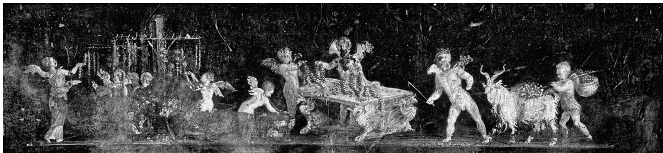
Fig. 6. Pompeii, Casa dei Vettii , room q, east wall; Cupids and Psyche handling garlands.

other scenes, three of which are only known by 19 th century engravings, show us the various steps in the production process. 46 In each of those, Cupids are depicted as sitting around a table above which is a rack from which hang strings around which flowers are to be attached. In the [209] Casa dei Vettii , however, the last two scenes show garlands that have already been made. Unless we suppose that there has been a temporal gap between the first scene of the Cupids leading a goat, and the other two, we cannot determine whether the packsaddle was intended to contain flowers rather than finished garlands. This aside, significantly, the preparation of the garlands themselves remains absent.