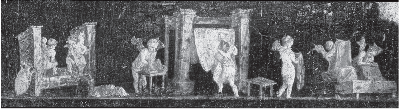
Fig. 2. Pompeii, Casa dei Vettii , room q, east wall; Cupids and Psyche preparing clothes.