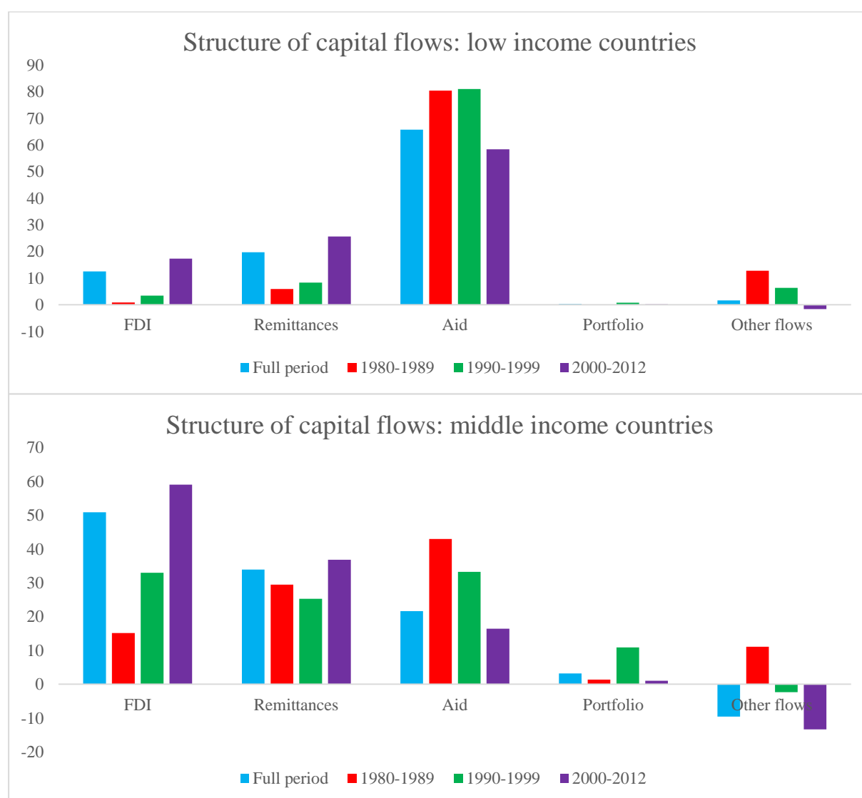
Figure2: Total net capital inflows and their structure (%)

development, official aid constituted the bulk of the inflows. It accounted for about 40 percent of the total financing for the MICs, and 80 percent for the LICs, more than remittances, the second largest category. In relation to the decreasing role of aid, the composition of ODA has also changed dramatically to a larger proportion of grants than loans. ODA flows are now focused primarily on LICs and on extending human capabilities, especially through health or education expenditures, rather than directly supporting productive investments or hard infrastructure as was the case during the 1980s.