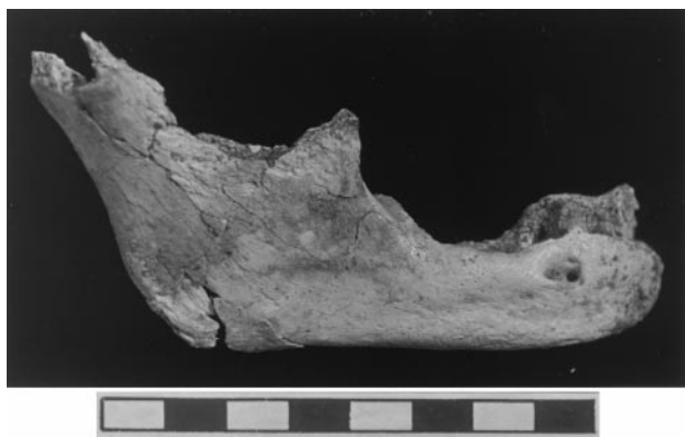
Fig. 4. Aubesier 11 mandible in norma lateralis right. Scale in cm.

the alveoli or the remainder of the corpus; the only teeth remaining are the apices of the right C_1 and P_3 roots.