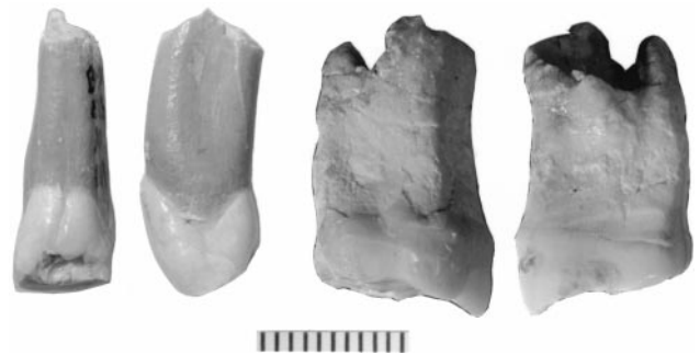
Fig. 2. Middle Pleistocene human dental remains from the Bau de l'Aubesier. From left to right: Aubesier 4 I 2 lingual, Aubesier 4 I 2 distal, Aubesier 10 M 1-2 mesial, Aubesier 10 M 1-2 distal. Scale in mm.

The results of the two models for the six samples give an average minimum age estimate of 169 \pm 17 thousand years (ka) and an average maximum one of 191 \pm 15 ka for layer H-1. Using the 2\text{-}\sigma range of these age estimates, the flint samples were heated either in OIS 6 or 7. The biostratigraphic indicators for layer H-1 are somewhat younger than these results. The human remains from layer I2, I-3, and K-1 derive from slightly deeper in the stratigraphic sequence than later H-1, and they therefore date to the later Middle Pleistocene.