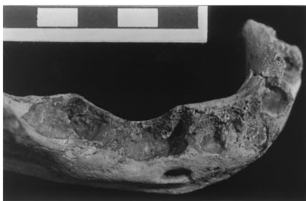
Fig. 5. Aubesier 11 mandibular alveolar arcade showing alveolar resorption, anterior apical abscesses, antemortem loss of the M_2 , and worn root apices of the C_1 and P_3 . Scale in cm.

The Aubesier 4 I^2 (13) is notable for its labial bi-convexity and pronounced shoveling. The crown exhibits strongly marked marginal ridges corresponding to grade 6 shoveling of the Arizona State University Dental Anthropology System (ASUDAS) scale (16). These ridges meet lingually at an ASUDAS grade 5 tuberculum dentale. Labially, the tooth is