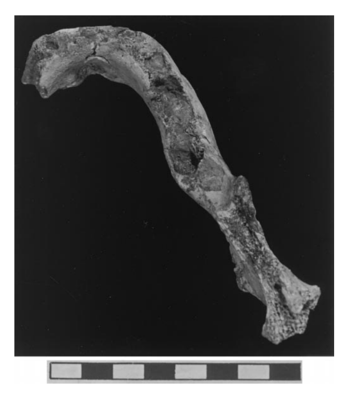
Fig. 3. Aubesier 11 mandible in superior view. Scale in cm.

Aubesier 4 consists of most of the crown and root of a moderately worn left I^2 , and Aubesier 10 is a slightly worn right M^1 or M^2 with minimal marginal postmortem erosion (Fig. 2). The Aubesier 11 mandible (Figs. 3–5) is largely complete from the left C_1 alveolus to the right condylar margins, but it has lost most of the coronoid process and sustained minor damage to the symphysis and the right gonial region. There is little damage to