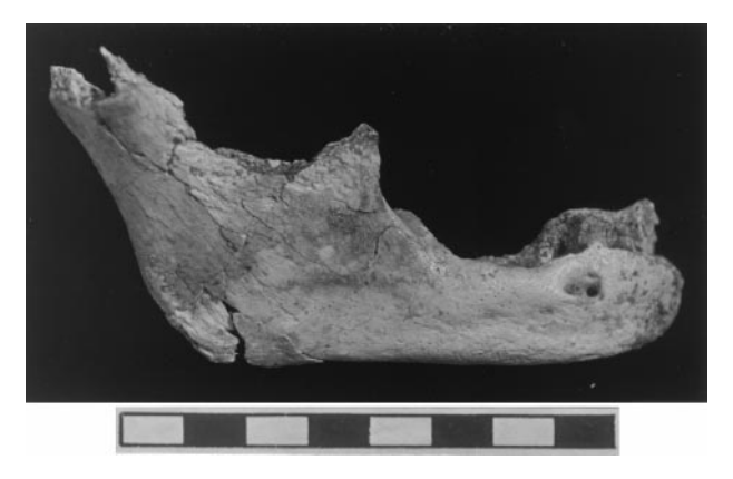
Fig. 4. Aubesier 11 mandible in norma lateralis right. Scale in cm.

the alveoli or the remainder of the corpus; the only teeth remaining are the apices of the right C_1 and P_3 roots.