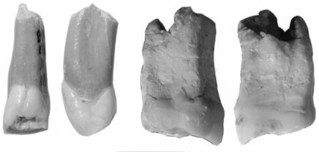
Fig. 2. Middle Pleistocene human dental remains from the Bau de l'Aubesier. From left to right: Aubesier 4 l<sup>2</sup> lingual, Aubesier 4 l<sup>2</sup> distal, Aubesier 10 M^{1-2} mesial, Aubesier 10 M^{1-2} distal. Scale in mm.

The results of the two models for the six samples give an average minimum age estimate of 169 \pm 17 thousand years (ka) and an average maximum one of 191 \pm 15 ka for layer H-1. Using the 2-\sigma range of these age estimates, the flint samples were heated either in OIS 6 or 7. The biostratigraphic indicators for layer H-1 are somewhat younger than these results. The human remains from layer I2, I-3, and K-1 derive from slightly deeper in the stratigraphic sequence than later H-1, and they therefore date to the later Middle Pleistocene.