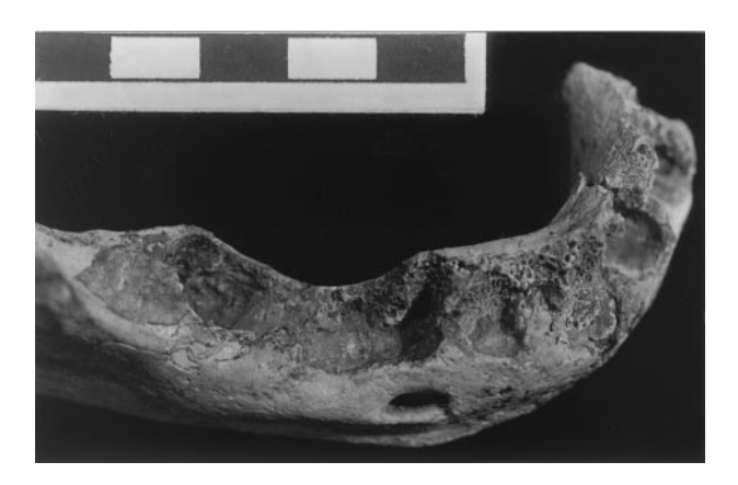
Fig. 5. Aubesier 11 mandibular alveolar arcade showing alveolar resorption, anterior apical abscesses, antemortem loss of the M_2 , and worn root apices of the C_1 and P_3 . Scale in cm.

The Aubesier 4 I<sup>2</sup> (13) is notable for its labial bi-convexity and pronounced shoveling. The crown exhibits strongly marked marginal ridges corresponding to grade 6 shoveling of the Arizona State University Dental Anthropology System (ASUDAS) scale (16). These ridges meet lingually at an ASUDAS grade 5 tuberculum dentale. Labially, the tooth is