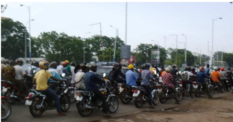
Fig. 2: Moto-taxis in Lomé (June 2016)

The case of Lomé, the capital of Togo, is a good example of both the momentum and limitations of the moto-taxi sector (Diaz Olvera et al., 2016). Estimated at 90,000 vehicles in 2011, zemidjans (or oleyias ), which provide a tailor-made mobility service, are by far the most popular mode of public transport in the capital of Togo (1.5 million inhabitants).