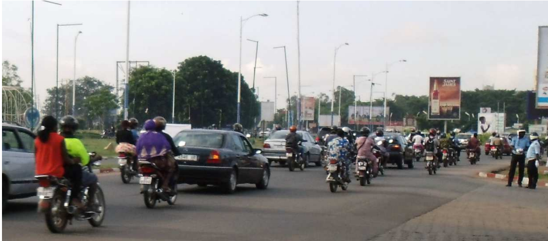
Fig. 3: Lomé, June 2016 – only moto-taxi drivers are obliged to wear helmets

In an economy where unemployment is rife and professional training limited, the moto-taxi activity offers a means of subsistence for many households. Yet the tough competition and poor working conditions frequently push drivers on a knife-edge: long working hours, recurrent health problems (backache, respiratory troubles, headaches, etc.), night shifts, carrying several passengers in one trip, transporting bulky goods. The authorities fail to enforce all the regulatory obligations, including those covering safety. Nonetheless, since 2015 the wearing of helmets by drivers has become more commonplace; alas not so for passengers (see photo below).