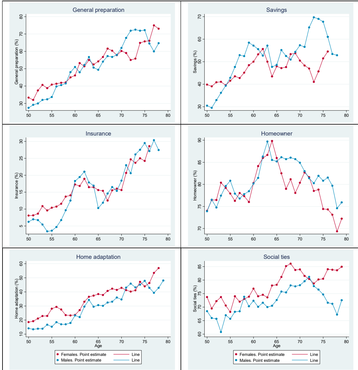
Descriptive statistics by age and gender

In the graphs below, a dot at age “x” represents the average preparation rate for individuals aged “x-2” to “x+2”. For example, a dot at age 50 represents the average preparation level for individuals aged 48 to 52.