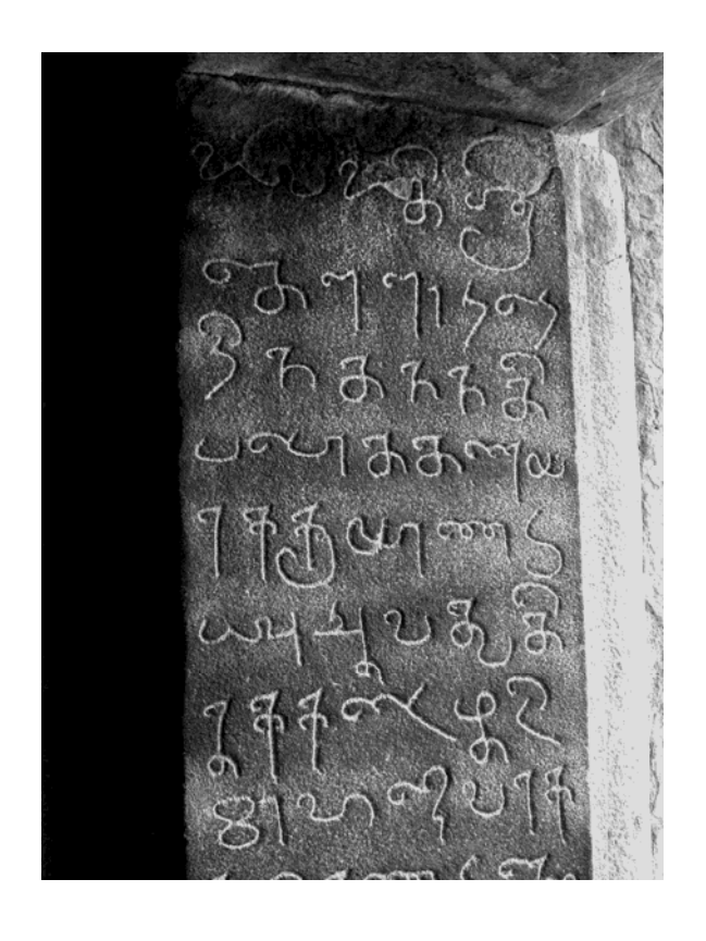
Fig. 1: Tirucceṇṇampūṇṭi, Caṭaiyar temple. Inscription dated to the 18<sup>th</sup> regnal year of Teḷḷāṛṛʾ eṛinta Nantippōttaraiyar (SII VII, No. 503; IP, No. 137), lines 1-8.