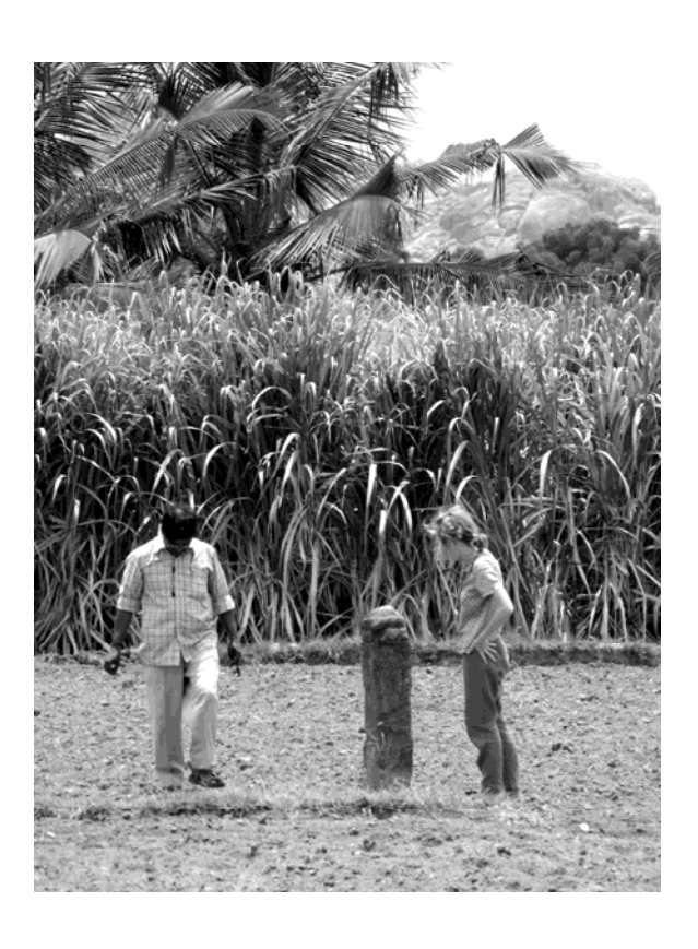
Fig. 2: Caṇikkavāṭi, pillar in a field with inscription dated to the 25<sup>th</sup> regnal of the Rāṣṭrakūṭa king Kṛṣṇa III (EI XL, No. 9).