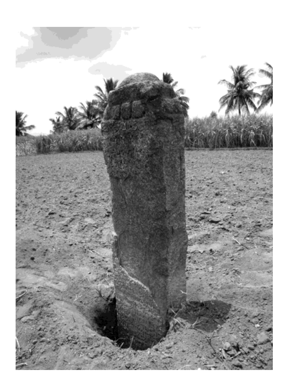
Fig. 3: Canikkavāṭi pillar inscription, front face.