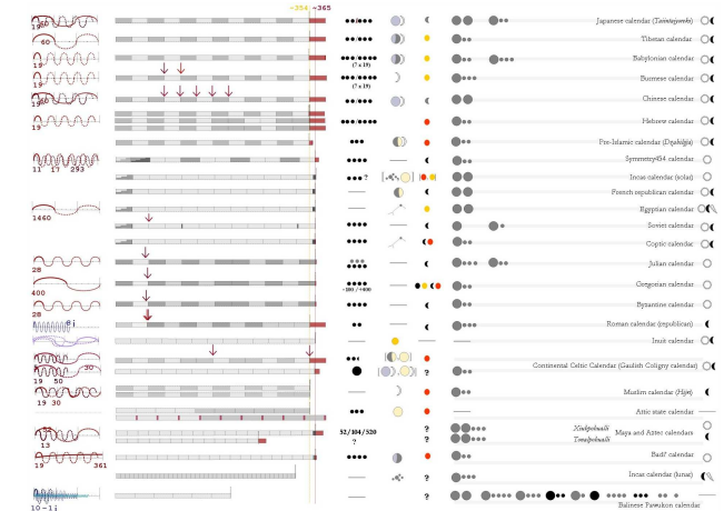
Fig. 2. Visual A visual comparison of 25 calendars

Note 1. Granularity taken into consideration in this study is limited to a ‘day’ unit.