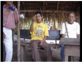
'one, finger-cl, thumb'