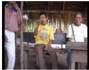
'two, finger-cl, index'