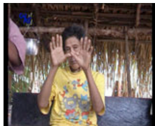
'two hands' (10)