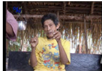
'the index finger-cl'