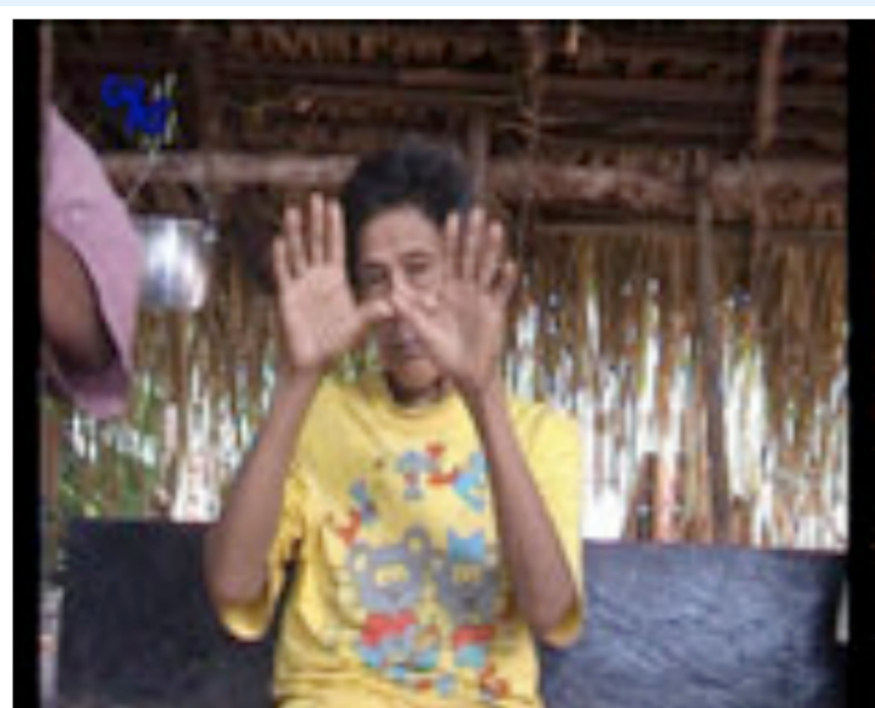
Figure 3, xepxep pûgbi

Crucially, chunks of more than two individuals are not observed. Moreover, any chunk is made of individuals of the same kind of objects (Feigenson, 2008). This constraint on homogeneity applies to additive structures as well.