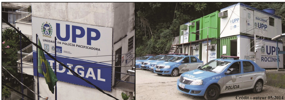
Illustration 1: UPP Posts in Vidigal and Rocinha, Justine Ninnin, 2014

In the field of public security, pacification works towards restoring certain fundamental rights that were previously limited in the favelas: the right to life, the right to freedom of movement, the right to property, access to justice, health, equipment and community services (Zaluar, 2013). Between 2012 and 2013, the