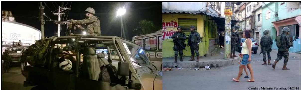
Illustration 2: April 2014, the army came in as reinforcement during the pacification of the favela complex of Marê, situated in the north of Rio de Janeiro.

The daily presence of armed police officers in the streets of pacified favelas, forces residents to adapt to new social rules and practices that, at the beginning, can provoke a certain resistance; what was previously resolved by criminal groups is resolved today by the police. The fact that police duties are being extended is disorienting for part of the population which is not sure what behaviour to adopt, in the face of police officers who are the holders of legitimate violence, mediators and sometimes educators even. There seems to be a transfer of governance responsibilities to UPPs. While for certain residents, the introduction of armed police officers in the public space, by day or night, ensures greater security, for others it is perceived as "military" intrusion in their daily life. It contributes to perpetuating the