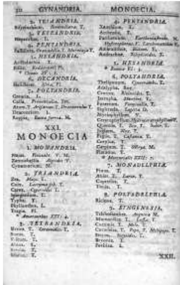
Figure 1: Linnaeus, Systema naturae , 2 d ed., Kiesewetter, 1740. Illustration of classificatory style.