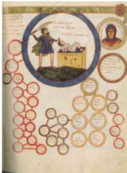
Figure 3: Généalogie d’Abraham , miniature, Saint-Sever, XIe siècle, from the Commentaire de l’Apocalypse of Beatus de Liebana, Paris, BNF, lat. 8878, f°8. Compare with Buffon’s genealogical tree.