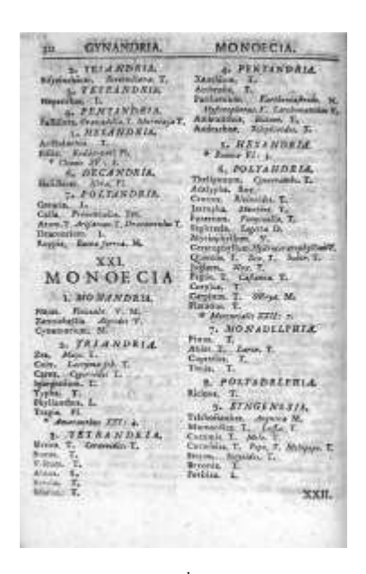
Figure 1: Linnaeus, Systema naturae, 2^d ed., Kiesewetter, 1740. Illustration of classificatory style.