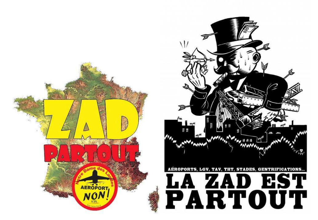
Illustrations 3 and 4: Examples of "ZAD partout" [tr. ZAD everywhere] posters.

[They were] anchored to the land, to the fields and other resisters, armed with new and methodical knowledge of the issues and a fierce obstinance. All these traits were woven together to create one fabric that was simultaneously a crucible and a refuge, a battleground for demanding a different way of life...And the more things happened, the more the acronym lost its original meaning. In its place, there was construction, friendships, moments of pure poetry, but also internal quarrels that were not always overcome, discordant voices, and suppressed distrust; and all that helped – through incessant meetings, heartfelt words, common practices, and solidarity in the face of a common enemy – to make this place into a Zone to be Protected" [translator's note: The acronym ZAD works in both cases in French: Zone d'Aménagement Différé and Zone À Défendre]. (Coordination, 2013: 4).