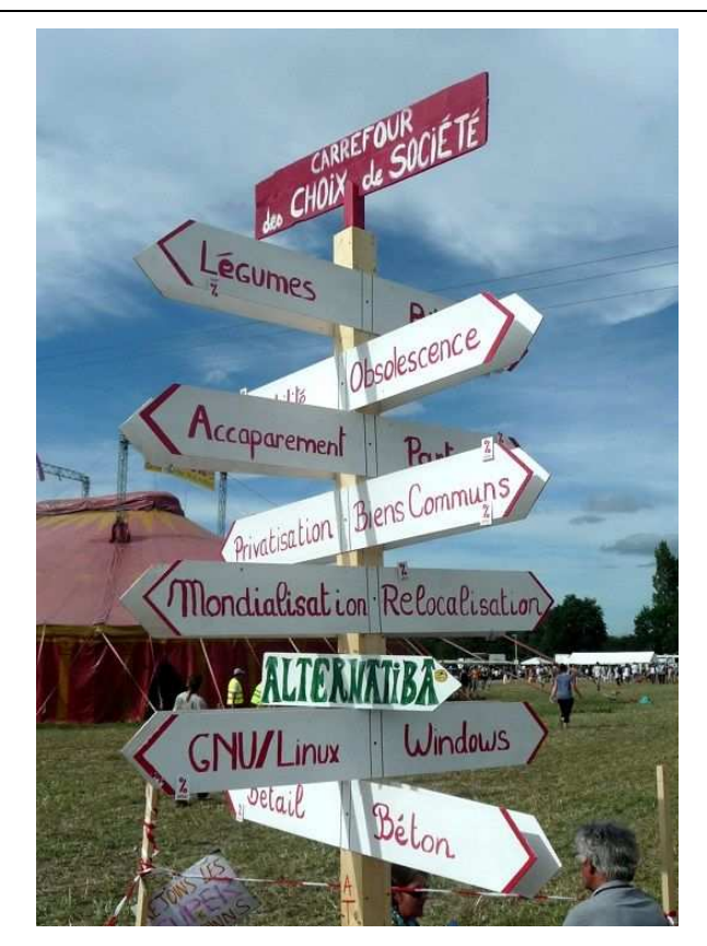
Illustration 6: Signage on the August 3 and 4, 2013 gathering site at Notre-Damedes-Landes.

The search for autonomy seems to be grappling with another problem: while "spaces of representation" of AGO opponents are focussed on rural space and its uses and purposes, the denounced "representations of the space" are determined by "the dominant space, that of the centres of wealth and power", i.e., urban space (Lefebvre, 2000: 61). Would autonomy in rural space then be through a change in the relationship with urban space?