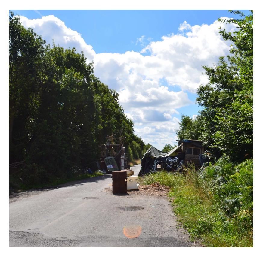
Illustration 2: A barricade: between a place for living and a place for the struggle. Anne-Laure Pailloux. August 2013.

and shacks, thus becoming " [tr.] as much a place for living as a place for the struggle". The situation forcibly created by the closing of this road by law enforcement authorities appeared to some as an opportunity to subvert its use. Of course, one of the issues behind this debate was the physical appropriation of the road, in the sense of control of the space. As a compromise, traffic-calming chicanes now run its length – passage is possible but slow – and they can quickly become barricades again (illustration 2).