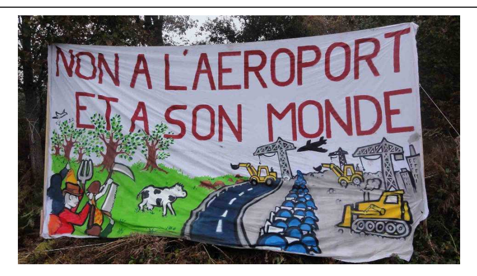
Illustration 5: Sign along a road during the re-occupation demonstration on November 17, 2012.