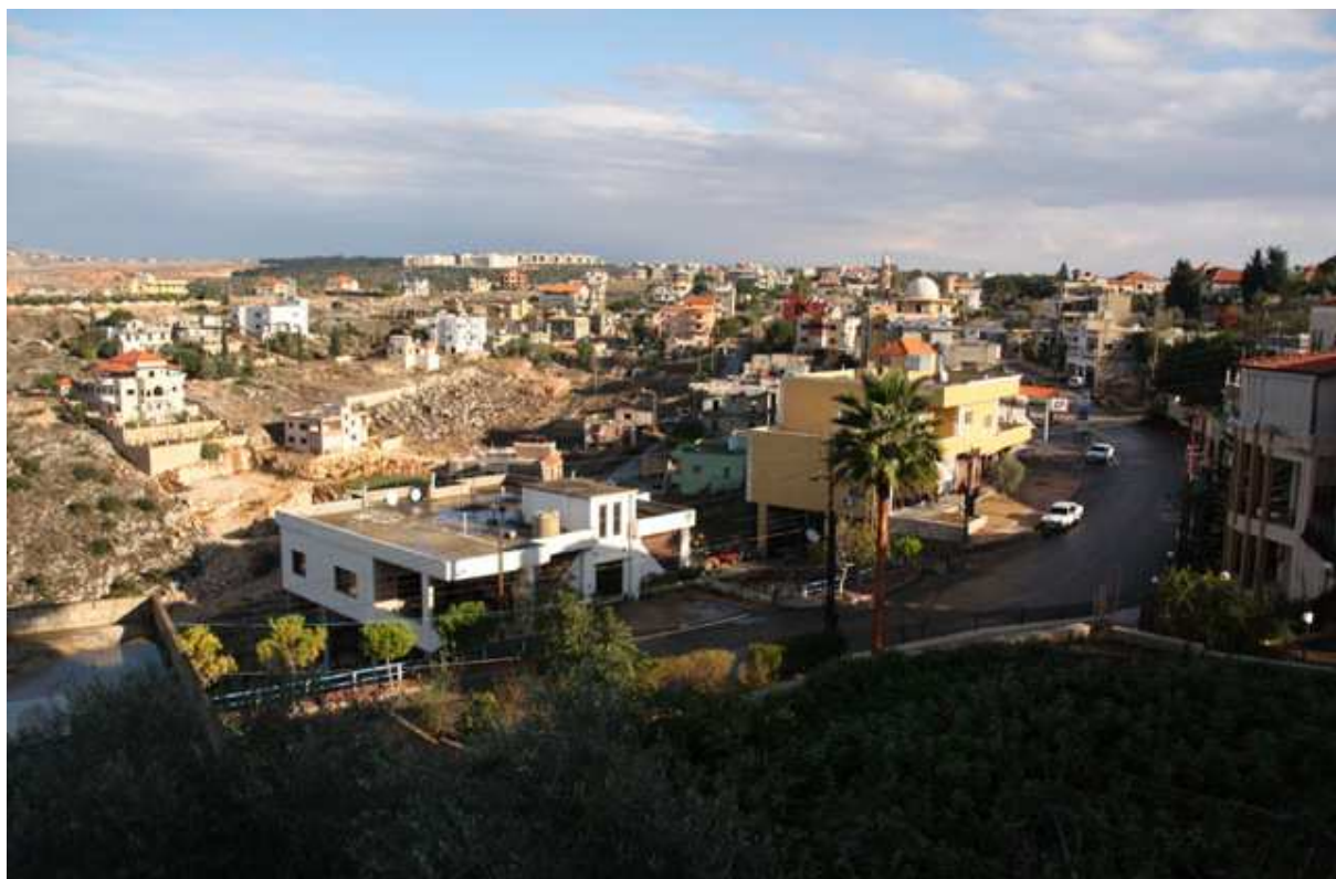
Figure 5: The area of al-hamra , where the urban extension is taking place (Gharios, 2013)

More generally, the case concerning the right to land for habitation reveals a dialectical contradiction. On the one hand, the very possibility of mounting a claim against the land owner/speculator, a figure well tied into the quasi-state sectarian