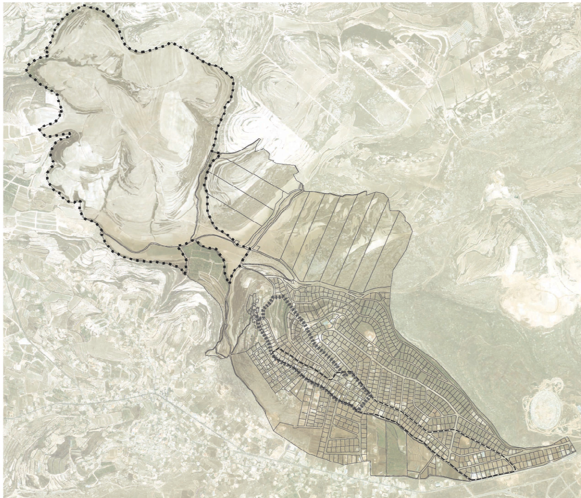
Figure 4: Map of Sinay showing the 'zones of interest' where contestations took place. Both the aerial photograph and the cadastral map are from 2005.