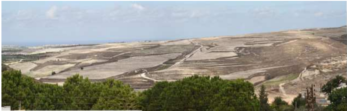
Figure 3: Overview of the agricultural area of al-duhur , showing the different agricultural plots (Gharios, 2013).

Farmers developed collective action to protect their use-rights. All of the farmers met and created a group to negotiate with the landowner. This confrontation opposed seven farmers who cultivated rain-fed crops over 121 hectares (some 78% of Zone x, see Figure 4: 'zones of interest') to the owner, who remained in Senegal during the conflict but asked his agent ( wakil ) to represent him in the negotiations. The mayor of the village acted as mediator in the conflict. After several months of negotiation, a new agreement was signed in which the 20% of production was replaced by a cash-rent by plot. A detailed survey of the land use was therefore conducted to define the exact areas planted by each cultivator and to determine the individual rents. In the months following the negotiation, at least one farmer decided not to plant his land out of fear of losing money.