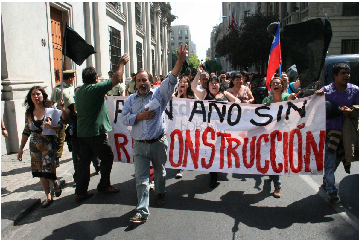
Figure 2. Demonstration of MNRJ and FENAPO "1 year without reconstruction" next to the presidential palace La Moneda in Santiago.

Many of these organizations participated in the "National Meeting: Citizens' experiences for just reconstruction" in Talca in January 2011. Two important events occurred during this meeting. First of all, the foundations of the first recommendations and citizen demands document were laid for reconstruction in a document entitled "[tr.] National Demand for Just Reconstruction" (MNRJ, 2011b) which was officially submitted to the presidential palace on March 7, 2011, one week