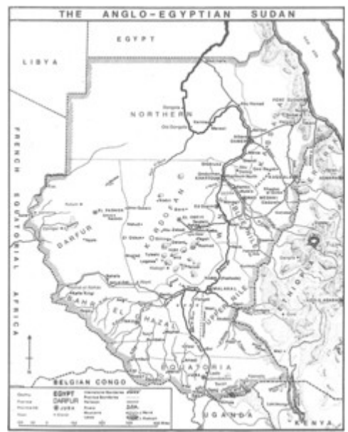
Click to view larger

In 1899 the Sudanese Mahdist state (1885–1898) was defeated by an Anglo-Egyptian army led by Major-General Herbert Kitchener. Sudan¹ was placed under "Condominium" rule for half a century before gaining independence in 1956. This dual form of colonial government, which was invented by Lord Cromer (British consul general in Egypt, 1883–1907), established joint Anglo-Egyptian rule over the country. Yet in practice all decision-making powers were retained by British officials while Egyptians occupied low-level posts in Sudan's administration and army. This is not surprising given that Egypt itself was subordinated to Britain to various degrees, evolving from a British-occupied Ottoman province (1882) to a British protectorate (1914), a nominally independent monarchy (1923) and a republic (1953). Although the Anglo-Egyptian Sudan was administrated in a similar way to other British colonial territories, it was not formally a colony, being attached to the British Foreign Office (FO) rather than to the Colonial Office (CO). The largest country in Africa was run by several hundreds of Britons relying on thousands of Sudanese, Egyptian, and Syrian clerks, translators, accountants, tax collectors, judges, and teachers.