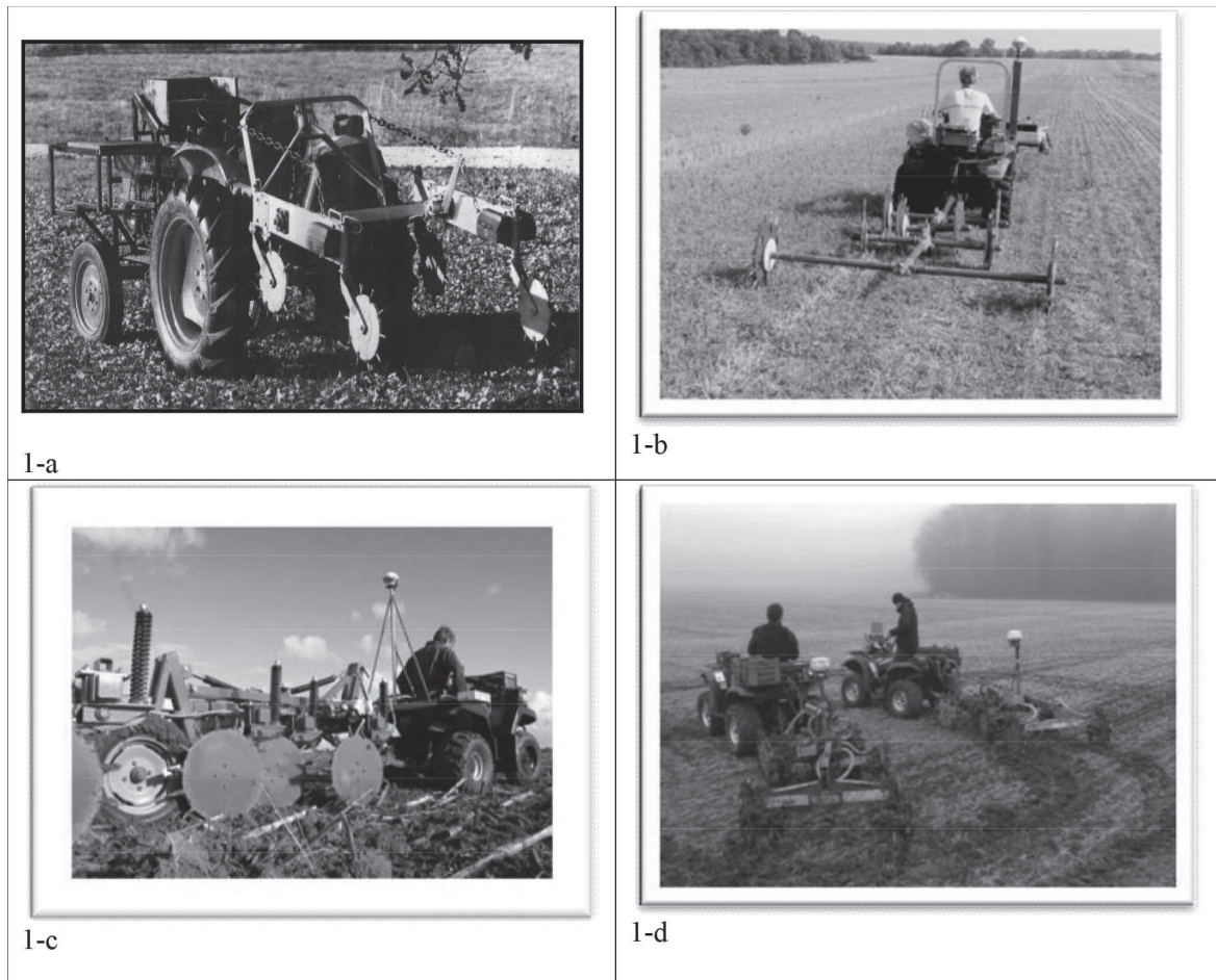
Figure 1. Evolution of the systems for continuous measurement of electrical resistivities ( 1a : Rateau, 1b :MuCEP; 1c: ARP01©; 1d : ARP03 ©)