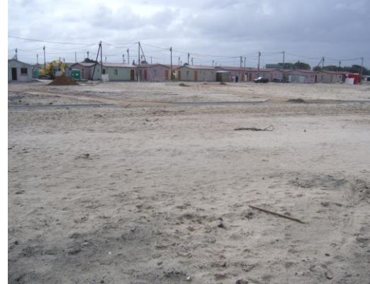
Photo 2: New Rest in Gugulethu (30/08/08). The Cape Flats are well-known for being flat and sandy.