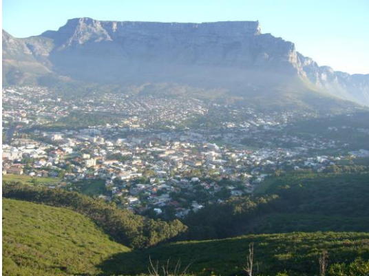
Photo 1: View of Table Mountain from Signal Hill (04/03/09). The City Bowl reinforces the image of affluent area isolated from the rest of the metropolis.

Photos 1 and 2: City Bowl and Cape Flats, when topography emphasises socioeconomic differences.