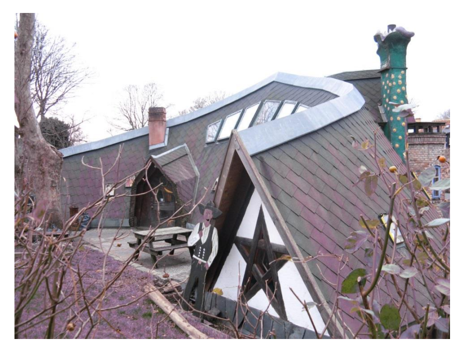
Figure 2: The back of Bananhuset.

Similarly, residents of Bacon's New Atlantis live in brick-built houses with glass windows. Both authors equate the ingress of light into dwellings with progress. While More imagines a plaster that performs something like Ordinary Portland Cement (OPC)<sup>20</sup>, though fundamentally different in being 'no-cost', Bacon's 'Chambers of Health' could be read as prefiguring concerns with indoor air quality (IAQ), particularly as contemporary sustainable architecture looks to increasingly draught-proof designs such as Passivhaus . By contrast, the patriarch protagonist of The Isle of Pines quickly knocks together a cabin of unhewn timber poles clad with boards recovered from his shipwreck and roofed with stretched sail-cloth, before getting down to the serious business of creating what Susan Bruce dubs 'pornotopia' - a place 'where mossy banks and trees provide all the shelter that one needs' (Bruce, 2008, p. xxxix).